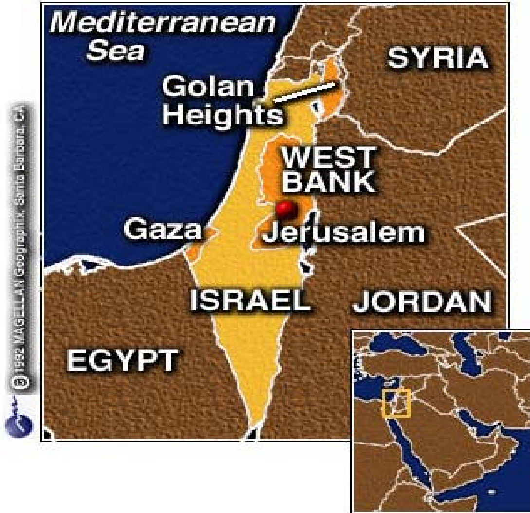
Figure 1. Israel and her neighboring countries

As Figure 1 illustrates, Israel lacks strategic depth. The IDF can ill-afford a battle within its borders so they will move the conflict to the opponent's Area of Responsibility (AOR).