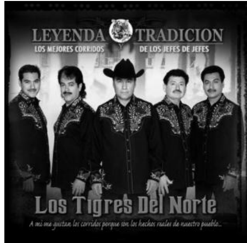
Figure 1. The typical norteaña narcomoda as displayed by Los Tigres del Norte. (From http://lostigresdelnorte.com/main/salbum/13 ).