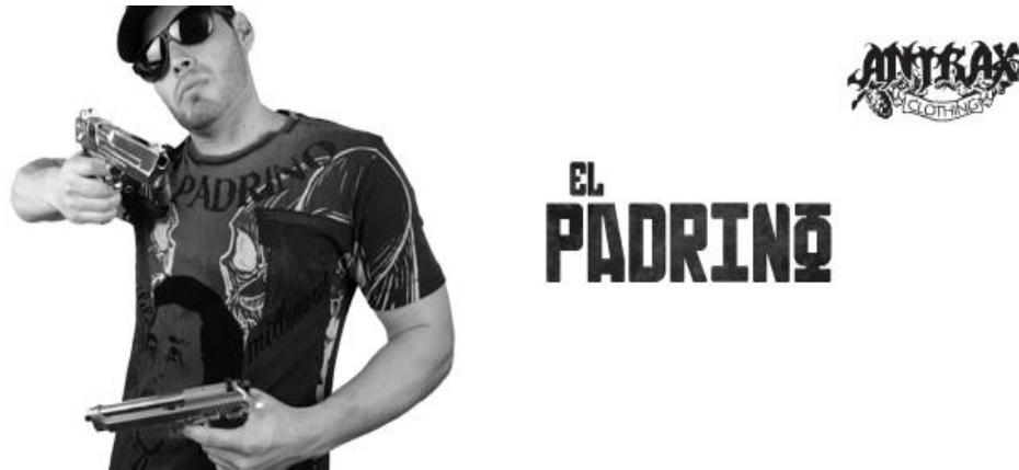
Figure 3. Advertisement of “El Padrino” style of Antrax Clothing. (From “Antrax Clothing,” 2012, http://www.antraxclothing.com/index.php )

millionaire.” 80 An example of Antrax clothing is shown in Figure 3. The original Antrax Clothing was decorative military vests inspired by the vests that many DTO members wear that contain a variety of pockets and compartments to carry short-wave radios, weapons, and ammunition. 81 The popularity of Antrax clothing line is demonstrated through the 128 videos available on YouTube regarding Antrax clothing, the 15,486 people who have “liked” Antrax on Facebook, the 409 followers Antrax has on twitter, and that over half their online merchandise is sold out. 82 Antrax clothing accommodates both the original cowboy style narcomoda in Mexico and the more modern narcomoda available throughout the United States, Mexico, and Canada.