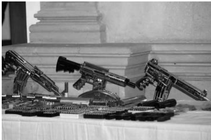
Figure 7. Weapons and bullets plated in gold, located in el Museo de Enervantes. (From “Museo del Narco,” La Poca Madre de los Poderosos , December 15, 2008, http://pocamadrenews.wordpress.com/tag/museo/ .)

symbolic and fashionable, they represent “rebelliousness, edginess, and danger,” much like rap, hip-hop, and the clothing associated with these genres. 125 The images of narcocultura, the clothing, the music videos, and the newspaper articles represent resonate with a variety of audiences because they have the “cool factor” and others desire to be like them. Narcocultura glamorizes violence; the blog “La Poca Madre de los Poderosos” describes el Museo de Enervantes , or the museum dedicated to the drug war located in the Secretaría de la Defensa Nacional . The museum is not open to the public, and is intended for military use only. One room in the museum displays a variety of jewel encrusted firearms, gold bullets, a gold plated handgun embossed with a portrait of the Virgin of Guadalupe (see Figure 7). A more recent addition to the collection was one of Alfredo Beltrán Leyva’s pistol embossed with a figure of Emiliano Zapata and the saying “Más vale morir de pie que vivir en rodillas.” or “It is better to die on one’s feet than live on one’s knees.” 126 These extravagant weapons romanticize violence and killing providing resonance and rhetorical force for those involved in the drug trade.