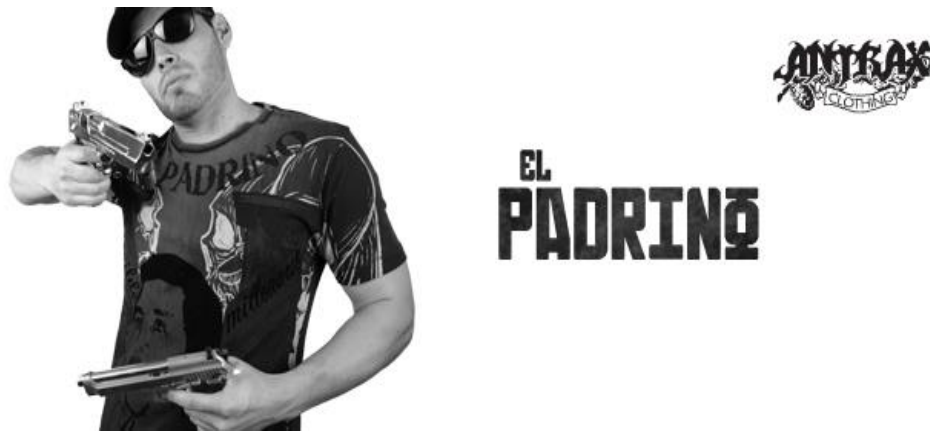
Figure 3. Advertisement of “El Padrino” style of Antrax Clothing. (From “Antrax Clothing,” 2012, http://www.antraxclothing.com/index.php )

millionaire.” 80 An example of Antrax clothing is shown in Figure 3. The original Antrax Clothing was decorative military vests inspired by the vests that many DTO members wear that contain a variety of pockets and compartments to carry short-wave radios, weapons, and ammunition. 81 The popularity of Antrax clothing line is demonstrated through the 128 videos available on YouTube regarding Antrax clothing, the 15,486 people who have “liked” Antrax on Facebook, the 409 followers Antrax has on twitter, and that over half their online merchandise is sold out. 82 Antrax clothing accommodates both the original cowboy style narcomoda in Mexico and the more modern narcomoda available throughout the United States, Mexico, and Canada.