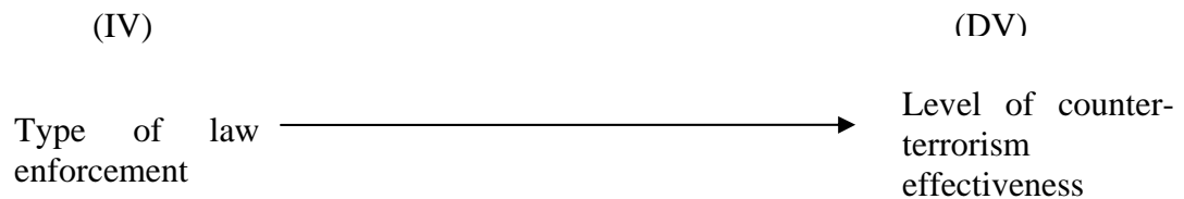
Figure 1. Hypothesis

If this is true, the military should not be used in a domestic counter-terrorism role; at least not in lieu of civilian police, but perhaps as a supporting element. Moreover, the Posse Comitatus Act does not need amendment, nor does it need to be repealed. A wide variety of legal tools are available that give civilian law enforcement additional powers to oppose domestic terrorism. Recent examples of this include the USA PATRIOT Act and the Foreign Intelligence Surveillance Act (FISA) allowing for expanded wiretap and eavesdropping authority. 23