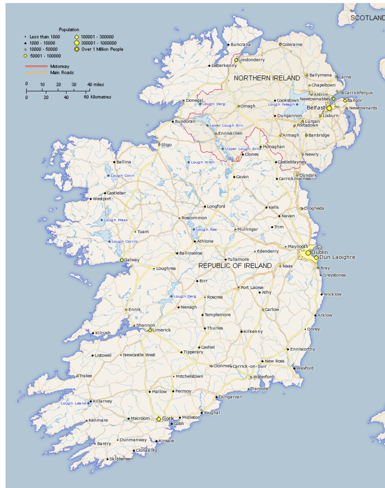
Figure 3. Map of Northern Ireland 86

The resulting state of Northern Ireland included a Protestant majority and Catholic minority, but Protestants feared a reversal of fortunes due to the rapidly growing Catholic population. The Religion Reports of Northern Ireland Census projected that in 1961 the Catholic population made up 35.3 percent of the total inhabitants, and increased to 36.8 percent by 1971. 87 They also believed that Catholics were innately disloyal, and systematically abused them. 88 A 1966-67 survey showed only 18 percent of Protestants