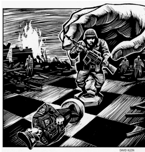
Figure 7. Military vs. Police Primacy (From: "Preserve Posse Comitatus," The Progressive ) 171

presently allows. Given the absence of any evidence to indicate that the military can be more effective than police in the lead role against domestic terrorism, and the civil liberty violations that would likely occur, public debate should preclude a military deployment beyond that currently allowed under the Posse Comitatus Act. This will also help ensure civilian supremacy in law enforcement.