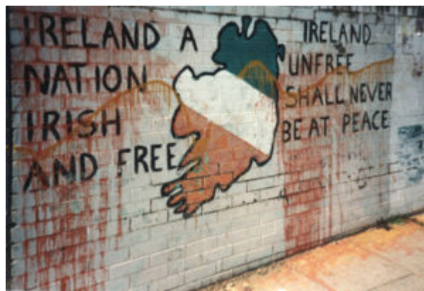
Figure 4. Republican mural in Derry 95

The PIRA formed in reaction to the OIRA's failure to protect Catholic communities in Northern Ireland. In addition to the defense of its people, it wanted the British out of Northern Ireland, but was unable to achieve this goal while the Army had the support of the population. Therefore, it employed a tactic of provoking British troops into over-reaction against Catholics to shift public sympathies towards themselves. 96 The