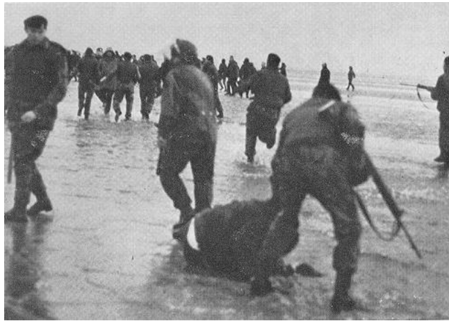
Figure 6. Anti-internment marchers beaten by soldiers 137

A final area of note is the use and collection of intelligence. It is a given in military operations that intelligence plays a critical role. In Ulster, the Army had no