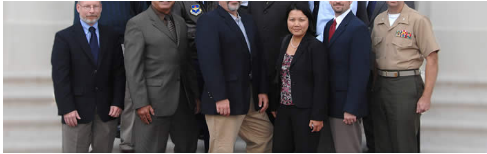
Group Photo of Participants at the Global Center Consortium Directors' Conference at the Naval Postgraduate School from 13 to 15 October, 2009