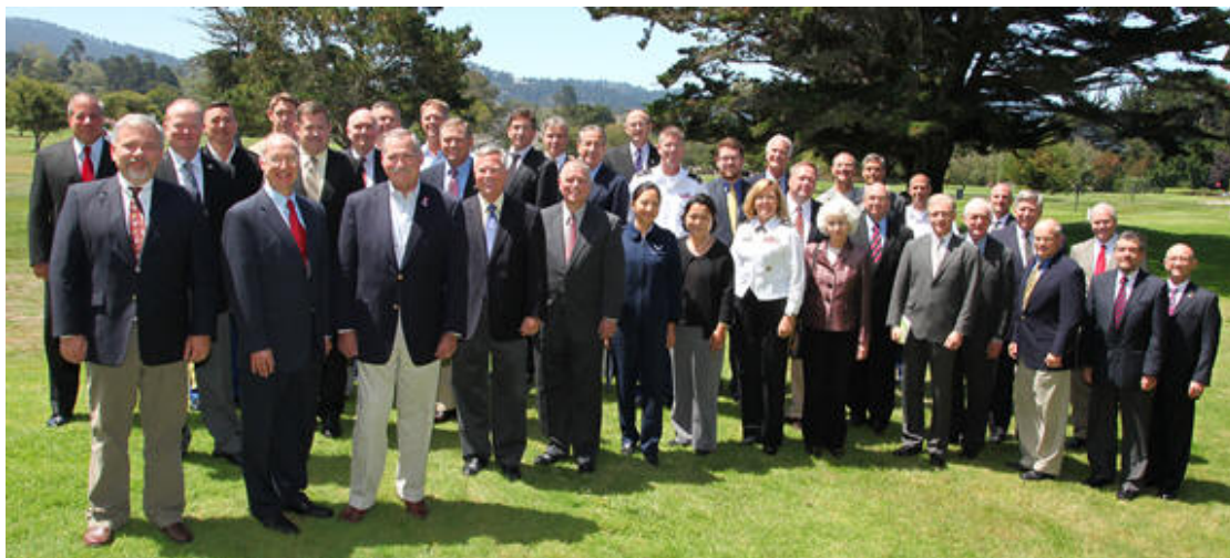
Global Center Consortium Directors' Conference in Monterey, CA from 10 to 12 July, 2012 Please click here for more information.

Commands added capacity and one-stop shopping for educational programs and resources.