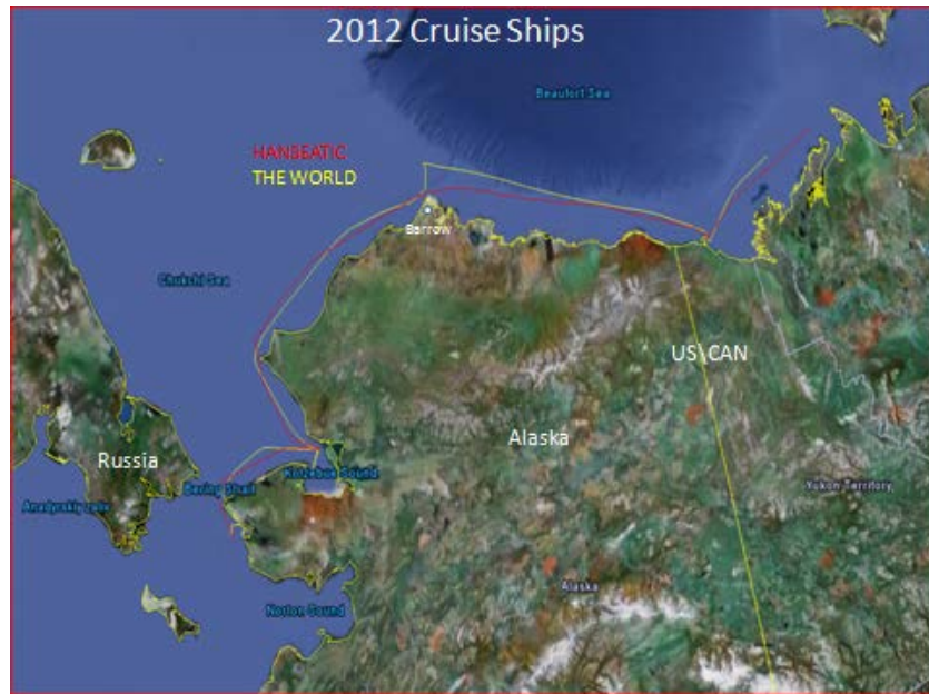
Figure 2. 2012 Cruise Ships (From U.S. Coast Guard District Seventeen, 2012)

Over the summer of 2012, the Coast Guard deployed 2 MH-60 Jayhawk helicopters to Barrow. The assets were pre-deployed to handle all missions including SAR. The aircraft has a maximum range of 700 NM with 7-hour endurance. The radius is 300 NM with search capability of 15-minute and 30-minute hover. The recovery capability is six people per trip. 198 The hourly cost of operating the MH-60 is approximately $11,500 according to the Coast Guard reimbursable standard rates. 199 With the Coast Guard's limited presence in the Arctic, it would take days to rescue the passengers and crew off of a small cruise vessel such as the WORLD by helicopter in the rough waters of the Arctic where boat rescue may be impossible.