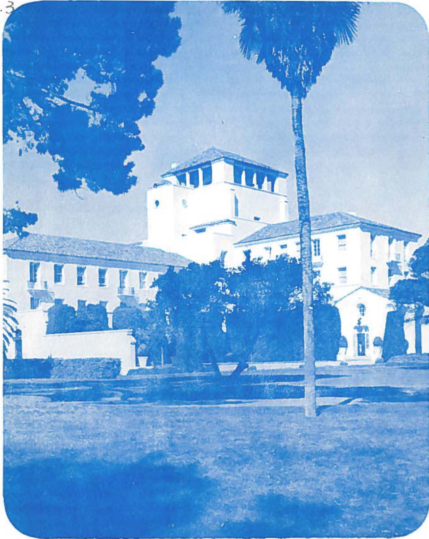
THE ADMINISTRATION BUILDING (FORMER OLD DEL MONTE HOTEL)