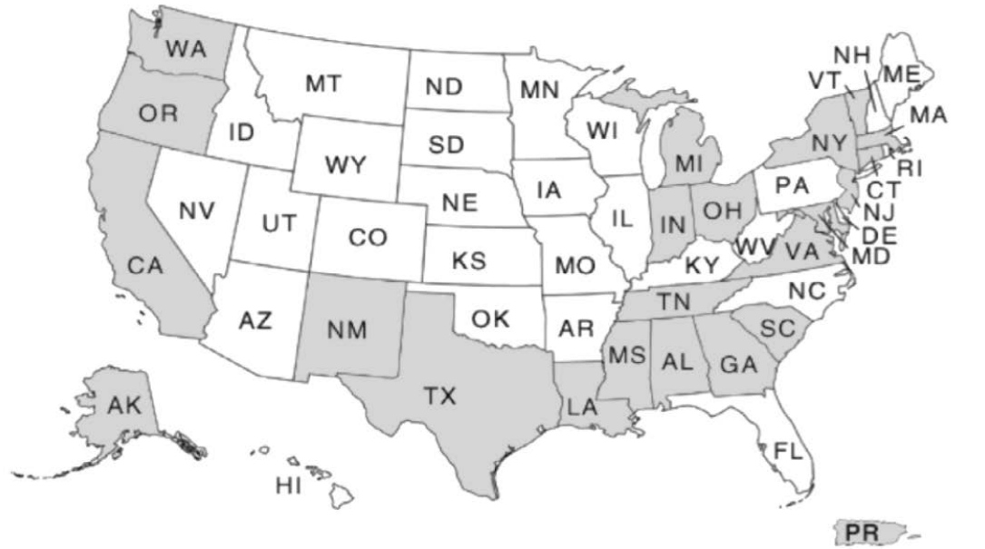
Figure 1. Location of SDFs as of March 2014. 19

Militia, and New Jersey Naval Militia were activated to assist in response measures, recovery efforts, and critical infrastructure security.” 18