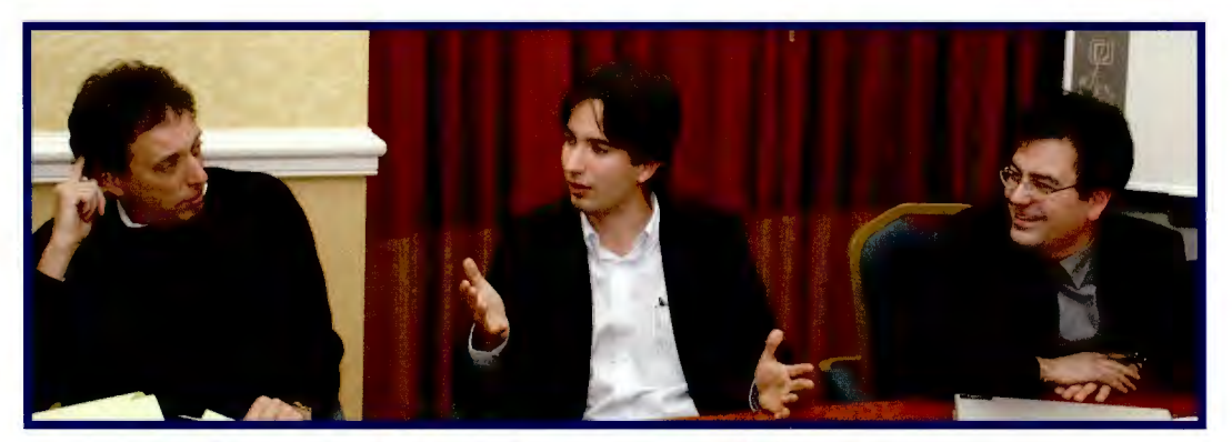
Conference attendees discuss the issues at the UAPI Continental Conference

he homeland security academic community can influence new methods of cooperation in continental security by making its research expertise available to policy makers and the media.