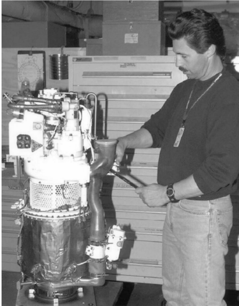
Figure 2. Employee performs repairs on an APU