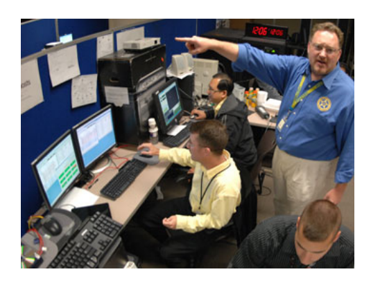
Figure 2.2: A photo from the NPS web site.