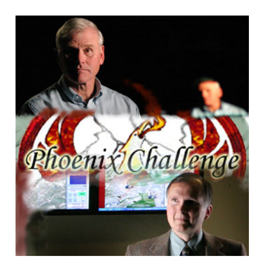
Figure 2.3: A second photo from the NPS web site.

name and give it a caption. The filename is then automatically set up as LAT_EX cross-reference. Use the figref{tag} command to get an in-paragraph reference. Figure 2.1 shows an example of this.