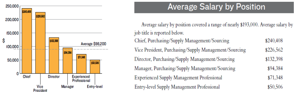
Figure 3. ISM's 2010 Salary Survey Results Summary (2010)

The Institute for Supply Management's (ISM) 2010 Salary Survey Results-Summary (see Figure 3) illustrates the average industry salary for purchasing/supply management/sourcing personnel. The average salary for entry-level supply management professional is $50,506 and mid-level, $71,348.