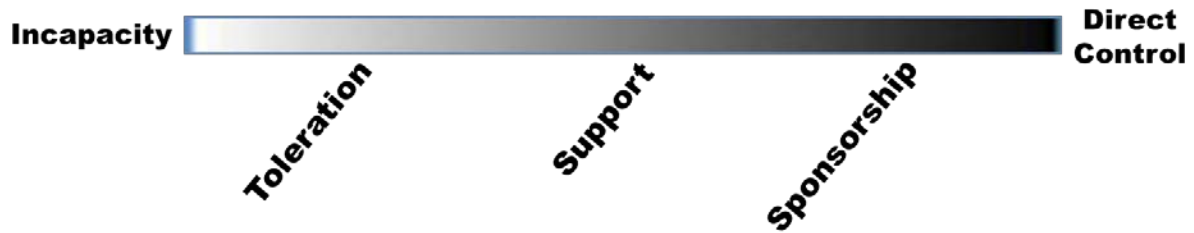
Figure 1. Spectrum Depicting the Level of Involvement Between a State Sponsor and a Terrorist Organization

The step beyond complete incapacity is “Toleration.” This occurs when the state is aware of terrorist activity within its borders and supports the terrorist agenda through willful inaction. The next level of involvement is “Support.” Here the state is actively providing a tangible form of support to the organization, but exercises no control over the organization’s actions. As the quantity and type of state support becomes increasingly valuable to the terrorist organization, the state begins to actively exercise a higher amount of control over the organization's activities and, in some cases, its ideology. This level is described as “Sponsorship.”