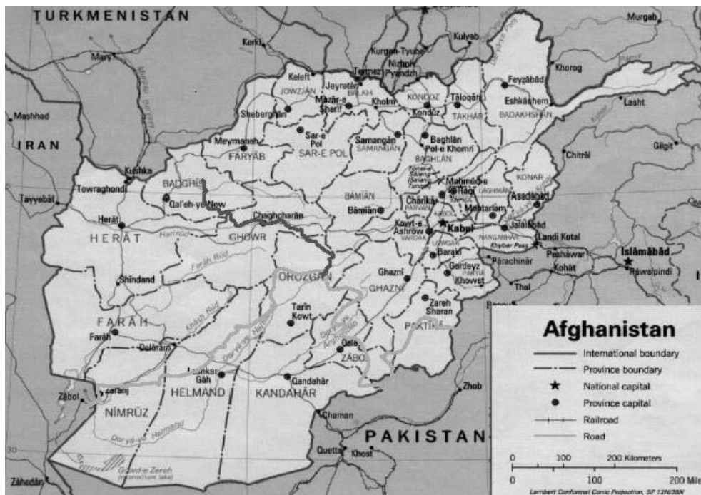
Map of Afghanistan

Should one find it unusual at all that Khan was being advised by Iranian Generals during the height of the United States and the Northern Alliance's campaign against the Taliban? Khan had just returned from his exile in Iran to rejoin the Northern Alliance and recognizing his long-standing relationship with the Iranians, it seems reasonable to expect such council. While Khan considers his role as "Amir" of Western Afghanistan seriously and openly challenges Kabul's leadership, there has been no evidence that he plans to create a formal, break-away "Western Federation," much less become a pawn of the Iranians.