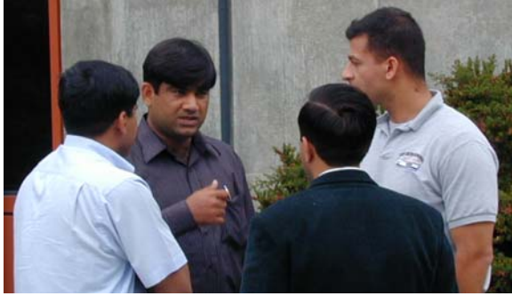
NPS student from Pakistan and the United States.