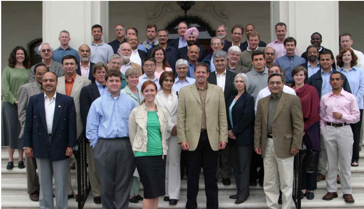
Monterey Conference Participants