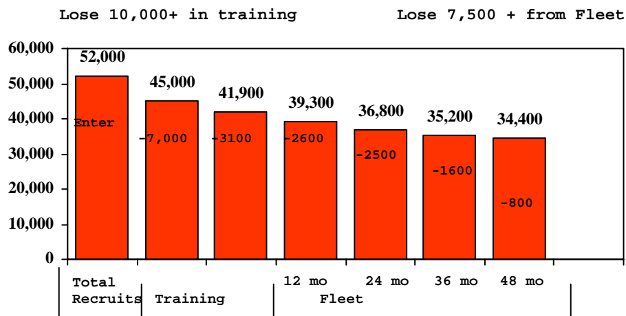
Figure 2. Accession Pipeline: Pre-Fleet and First-Term Attrition.

either for medical conditions that existed prior to service, or for physical problems that develop while enlistees are in training; (2) separations for fraudulent or erroneous enlistment, indicating either that the service did not detect the disqualifying conditions prior to their enlistments or the enlistees deliberately withheld disqualifying information; and (3) separations for performance problems, such as failure of the physical training test, misconduct, exceeding weight and body fat standards, character and behavior disorders, alcoholism, drug use, homosexuality, loss of motivation, or inability to adapt to military life (Cymrot, Golding, & Parcel, 2001). Figure 2 shows that of 52,000 recruits, over 10,000 potential Sailors attrited during their pre-fleet training, and over 7,000 suffered first-term attrition (Alderton, 2002). Pre-fleet and first-term attrition have far-reaching consequences, such as wasted investment in training, time, and equipment. More importantly, attrition reduces the number of trained Sailors who enter the fleet.