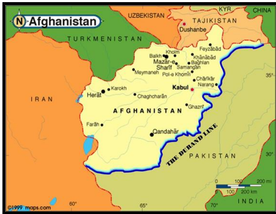
Figure 2. The Durand Line: Western Frontier of Pakistan 14 .

FATA is geographically part of Pakistan, but difficult to govern. For centuries the tribal people have resisted invading armies and have maintained self-rule based on local traditions and values. This study provides an analysis of how the semiautonomous tribal areas can be gradually absorbed into Pakistan while offering a strategy to solve administrative, political, and economic problems so the government may establish its writ in the tribal areas and FATA can play a major role in the future of the nation.