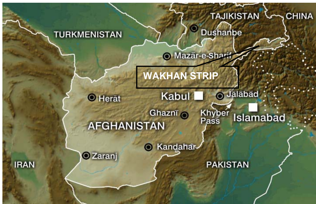
Figure 4. Northern and Western borders of Afghanistan and Wakhan Corridor. 44

The Forward policy meant control of natural frontiers. This policy was aimed at the physical occupation and direct administration of the area. It was formulated against the backdrop of Russian advancement, which challenged British supremacy in south Asia and demanded recognition of the need to defend India. Different viewpoints were expressed about how far west and north the British should go: the river Oxus line, the Hindukush line or the Kabul-Ghazni-Kandhar line. It was the last which the British decided to occupy in case of Russian moves towards India. 43