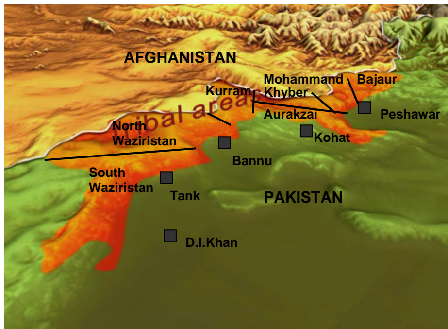
Figure 1. Tribal Areas: Federal and Provincial Tribal Areas 11

Waziristan) and five Frontier Regions (FR) (Peshawar, Kohat, Bannu, Dera Ismail Khan, and Tank) with a total area 6 of 27,220 square kilometers (larger than the American state of Vermont, with 24,903 square kilometers, and smaller than Maryland, with 31,849 square kilometers). 7 After the creation of Pakistan only three new agencies were created 8 : Mohmand in 1951, and Bajaur and Orakzai in 1973. 9 The tribal areas have a population of 3.7 million, according to the 1998 national census. 10 The governor of NWFP acts as executive head of FATA on behalf of the federal government.