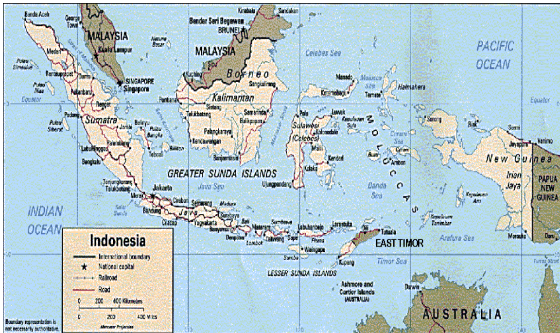
Figure 1: Map of Indonesia