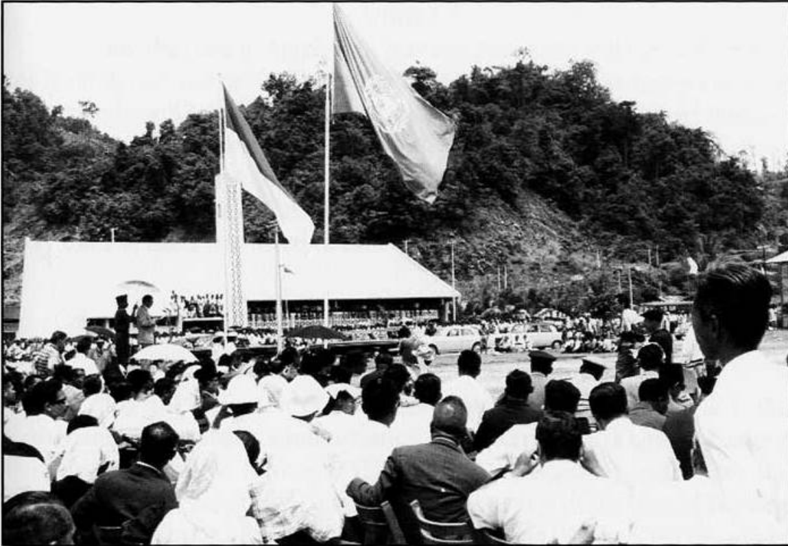
Figure 3: Transfer of Sovereignty in 1969