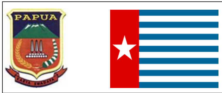
Figure 5: West Papua Symbol and OPM Flag

practice, the national government, police and military associate all activities involving West Papuans who use these symbols – most notably the flag – with the independence movement and therefore attempt to ban them.. The West Papuan flag, however, is also commonly associated by some of the independence activists with the OPM flag, instead of the province's flag.