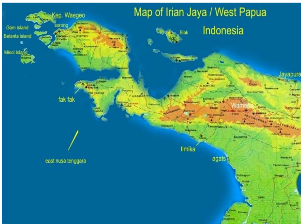
Figure 2: Map of West Papua

(President Sukarno, Jogjakarta, 19 December 1961) 10