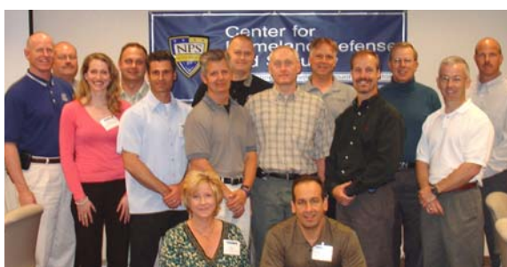
New Homeland Defense & Security Students

On May 4, CHDS welcomed the fifth homeland security master's degree class to the NPS campus. 31 homeland security officials from around the country—from local, state, and federal governments as well as the military—attended the class. Included in the student mix is the first homeland security international student, a military officer from Canada who is on detail at the U.S. Northern Command.