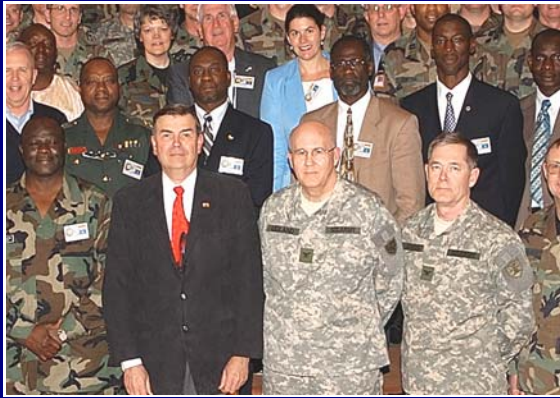
The North Dakota National Guard with their Ghanaian counterparts