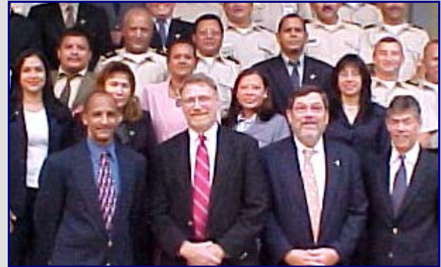
DRMI instructors (front row) with students in Honduras