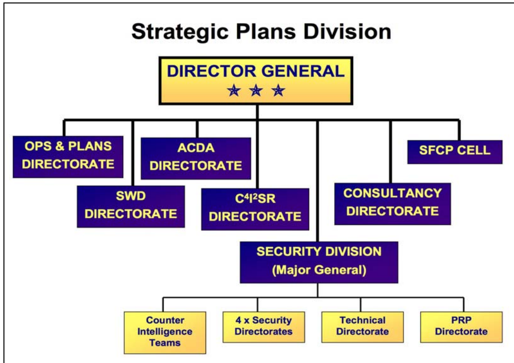
Graphic 2 Strategic Plans Division