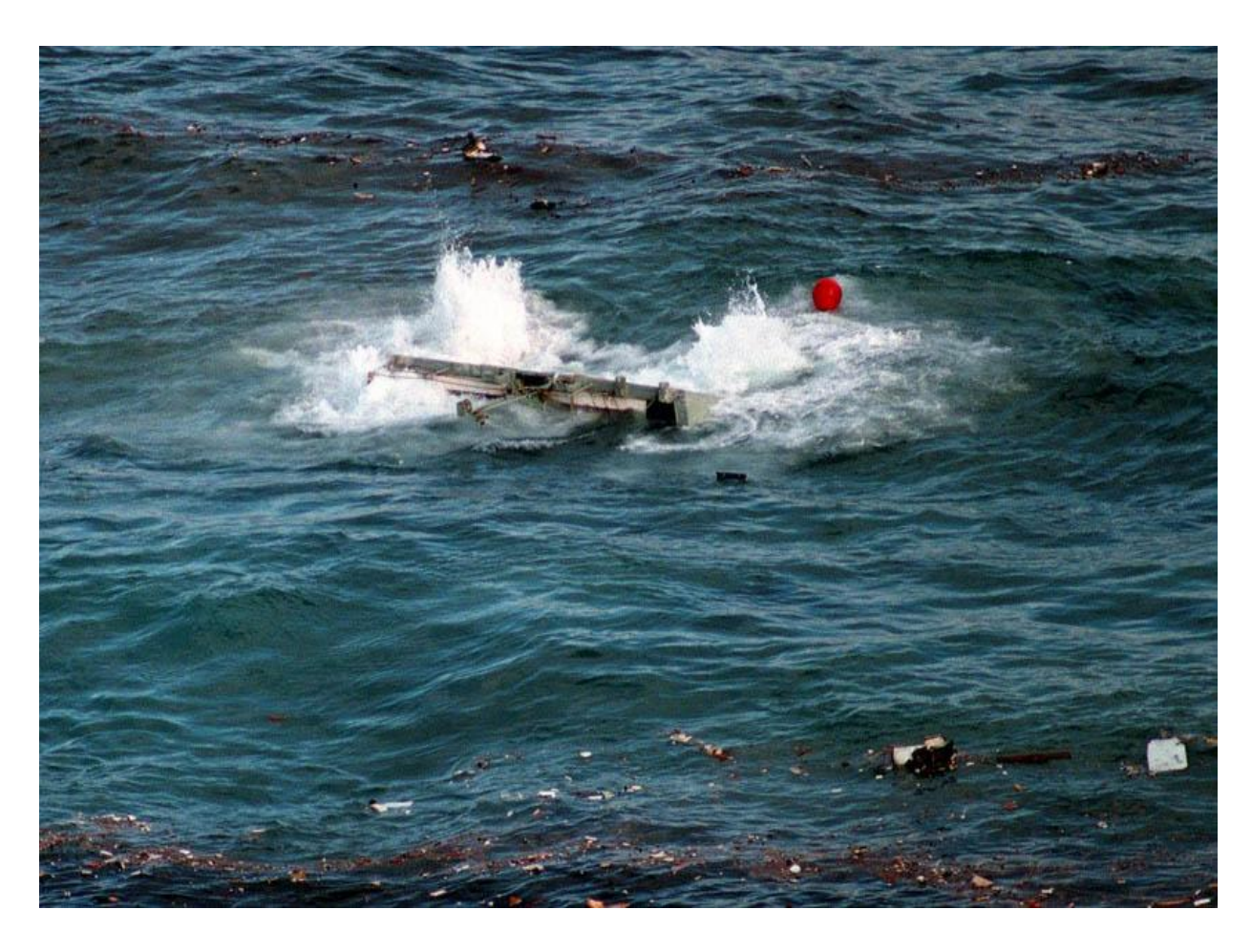
Figure 9 is a close-up photograph of the residual debris field.

Figure 9.The Stern Disappears(Navy Undersea Warfare Center, 1999)