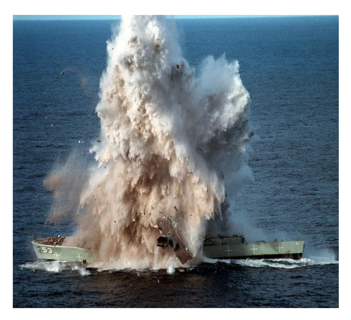
Figure 6 shows that the level of damage is now catastrophic.

Figure 6. Bow and Stern Sections Separate (Navy Undersea Warfare Center, 1999)