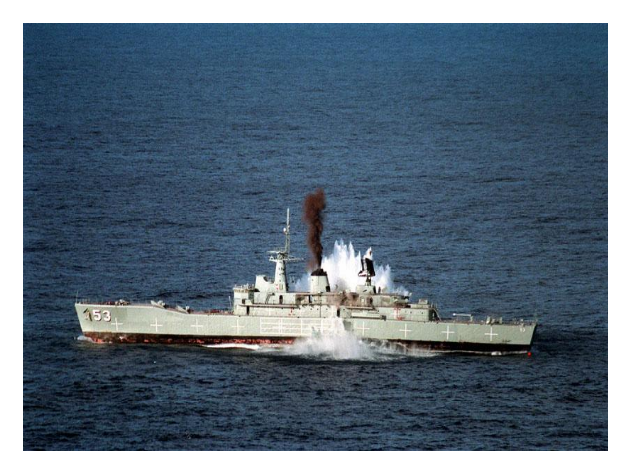
Figure 3. Initial Reaction (Navy Undersea Warfare Center, 1999)

Figure 3 is a photograph of the moment the torpedo was detonated. The photograph shows that smoke has been blown out of the stack because of the power of the explosion, and it shows that water is starting to erupt on either side of the ship. In Figure 3, the ship already appears to have had its keel broken because the bow and the stern are lower than the center of the ship.