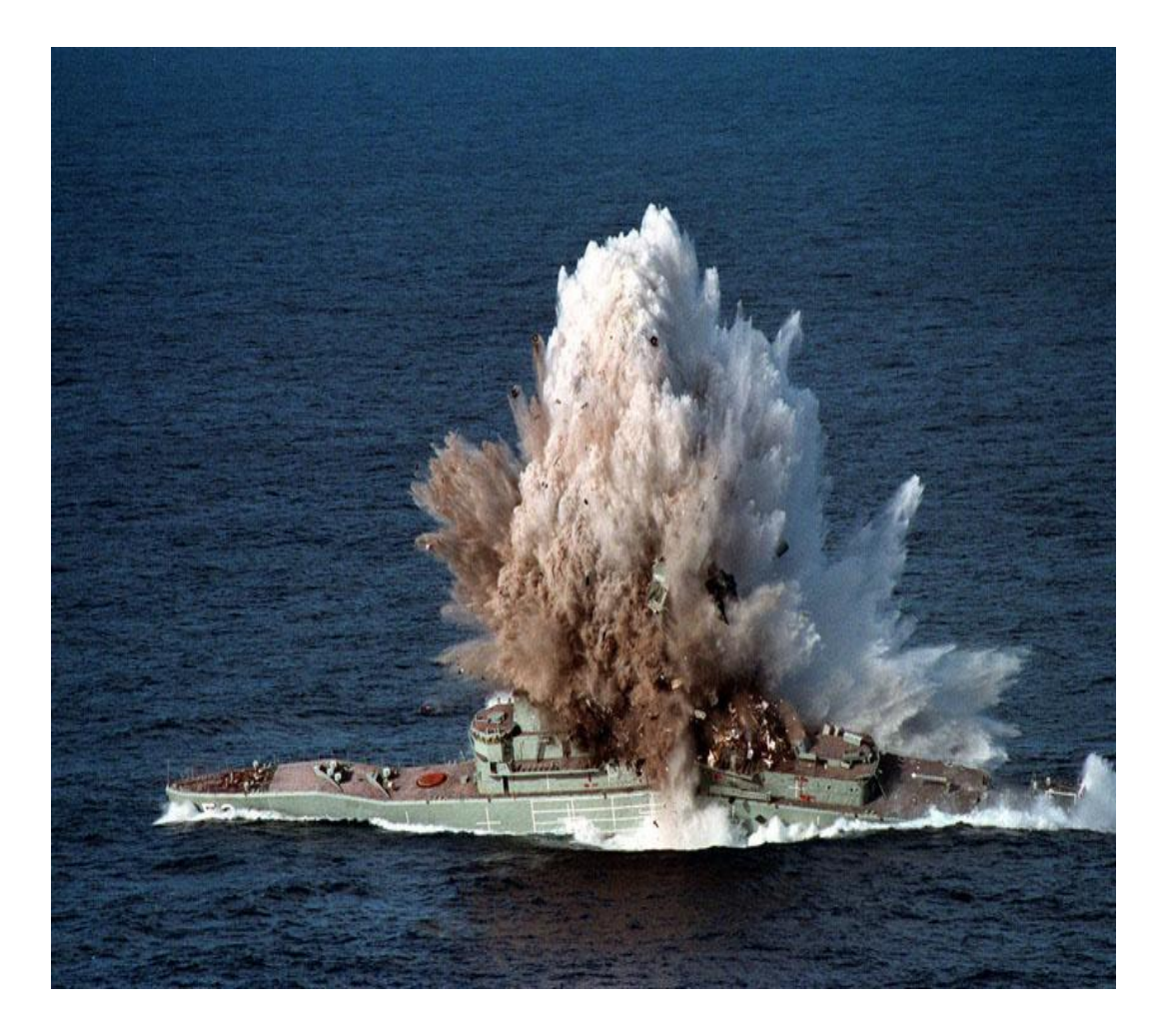
Figure 5. The Keel Has Broken (Navy Undersea Warfare Center, 1999)

Figure 5 clearly shows that the back of the destroyer has been broken. The extensive level of damage that is taking place is obvious.