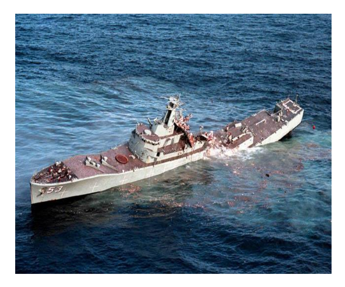
Figure 7.The Stern Begins to Sink

As the smoke clears in the photograph in Figure 7, it is clear that the destroyer has broken into two halves and that the stern section is about to sink.