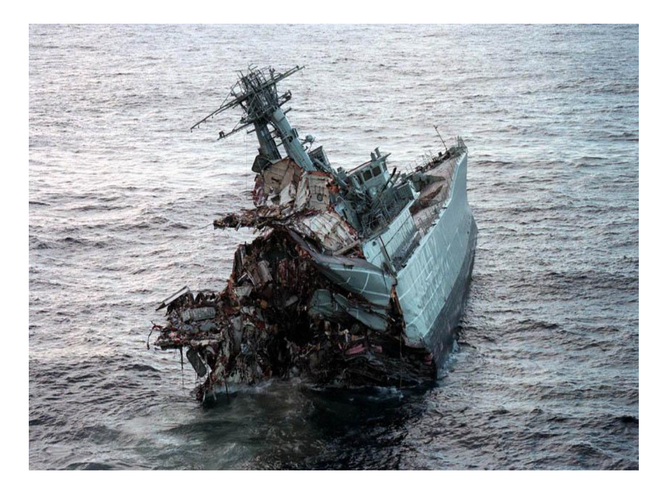
Figure 10. The Residual Bow Section (Navy Undersea Warfare Center, 1999)

Figure 10 is a photograph of the bow section of the ship. As the photograph shows, it is not economically repairable. The damage is so bad that by the time the Australian Navy would have tried to salvage what is left there in order to rebuild a new ship around it, it would have been better to have started from scratch. Plus, ship designs evolve, and if this were an older ship, it would probably be better from a cost-effectiveness standpoint to acquire a "latest and greatest" warship of a similar class to replace this one. In this test, the bow section actually sank a few hours after the photograph in Figure 10 was taken.