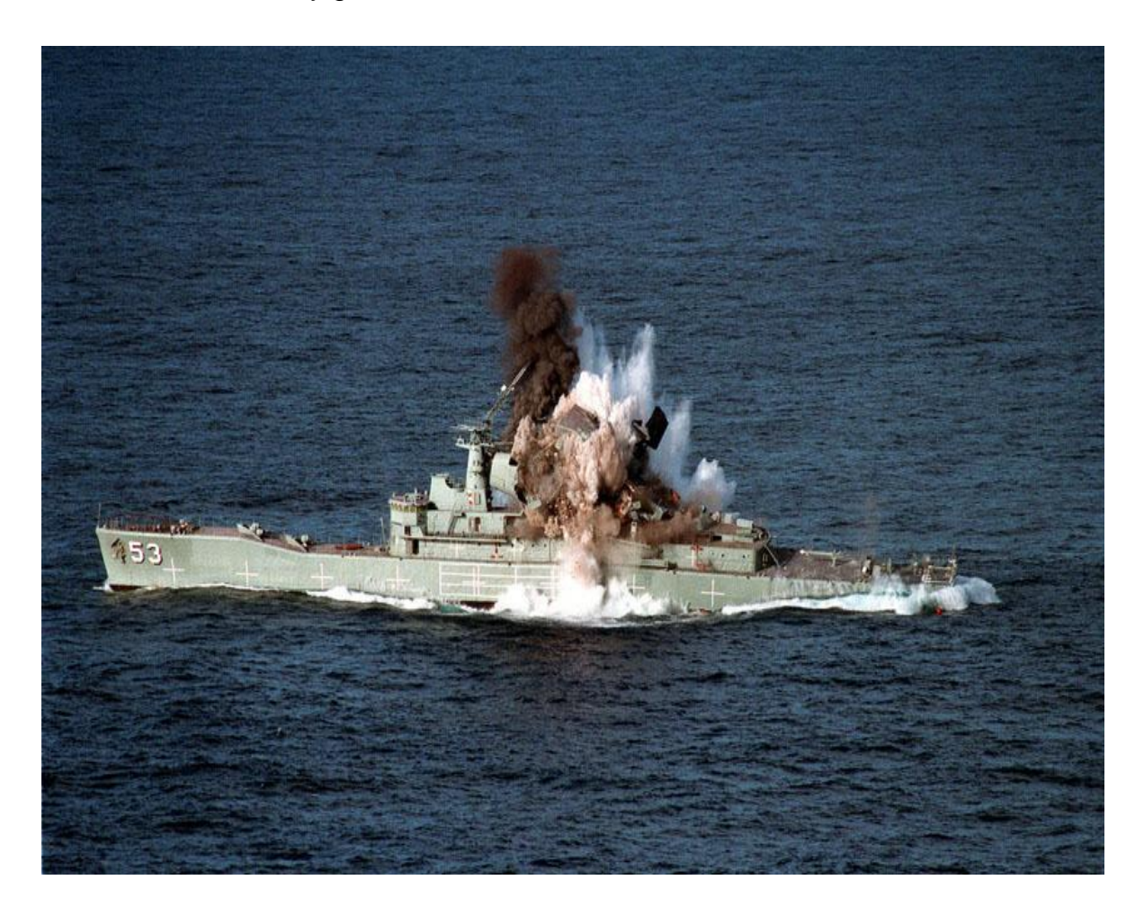
Figure 4. Further Damage (Navy Undersea Warfare Center, 1999)

Figure 4 is a photograph of a few seconds, maybe even milliseconds, later. The explosion has propagated even further, and the power of the torpedo warhead's explosive is visible as it goes straight up through the bowels of the ship along the center line—and it only gets worse.