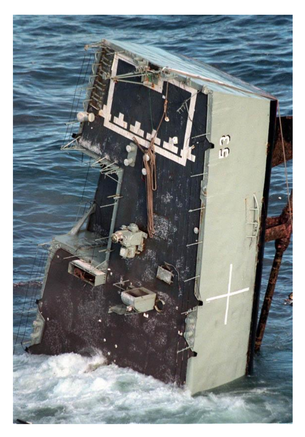
Figure 8. The Stern Slips Under the Waves (Navy Undersea Warfare Center, 1999)

Figure 8 shows that the observation made in Figure 7 is accurate: the stern section is headed to "Davey Jones' Locker." The photograph in Figure 8 is a close-up of the destroyer as it slips beneath the waves.