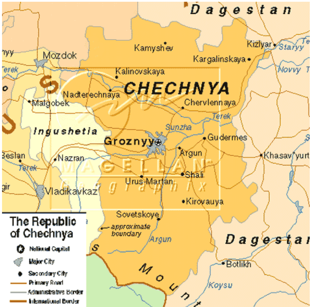
Figure 3. The Republic of Chechnya