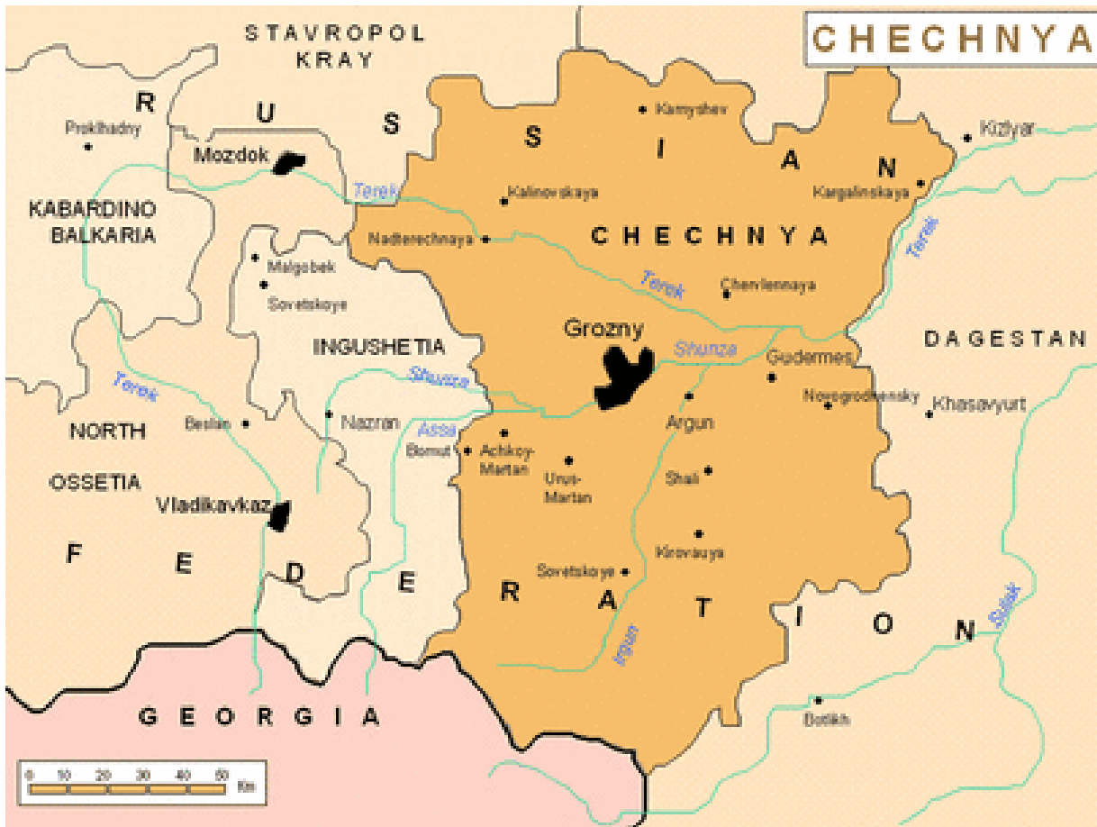
Figure 2. North Caucasus Region

http://www.chechenpress.info/g/displayimage.php?album=4&pos=0