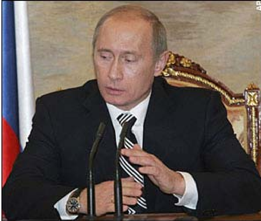
Figure 5. Russian President, Vladimir Putin

http://www.telegraph.co.uk/news/main.jhtml?xml=/news/2007/12/03/wrussia503.xml