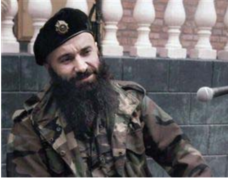
Figure 7. Chechen Rebel Leader, Shamil Basayev in September 1999

http://www.rferl.org/featuresarticle/2006/07/290e68ae-54e1-49c3-9fb9-9b4bd72d34a4.html ;