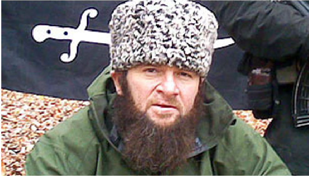
Figure 8. Chechen Rebel Leader, Doku Umarov

http://kavkazcenter.com/eng/content/2007/11/22/9107.shtml