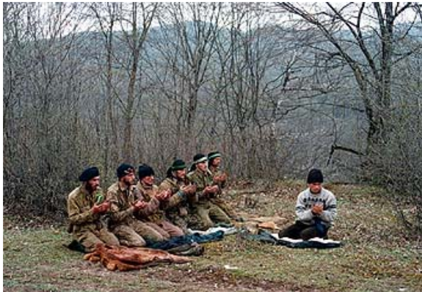
Figure 9. Al-Mujahideen in Chechnya

http://kavkazcenter.com/eng/content/2007/11/22/9107.shtml