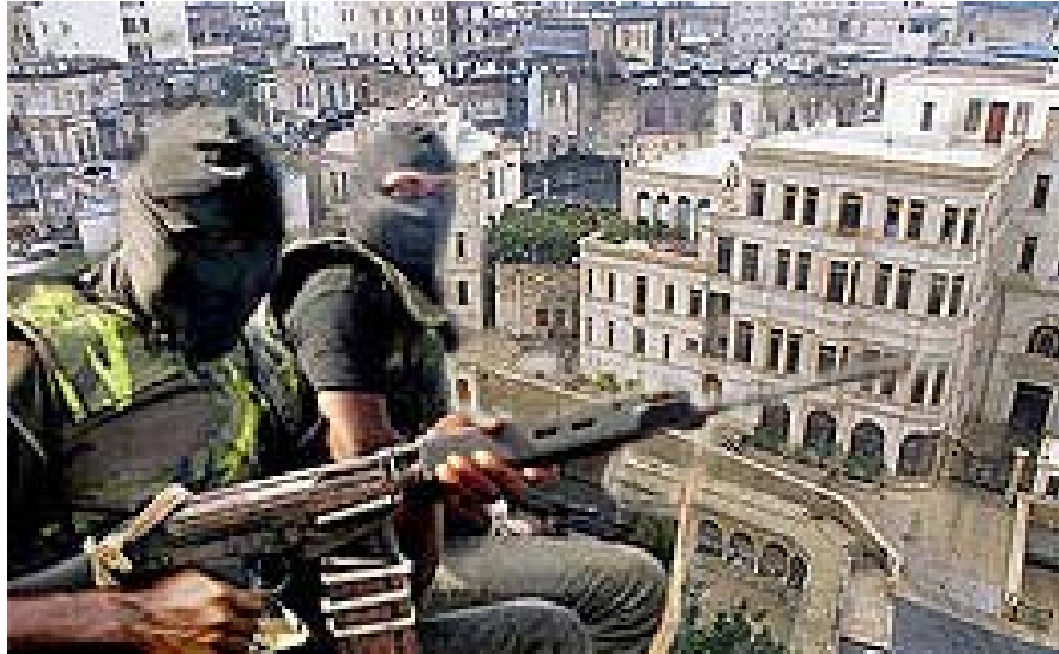
Figure 10. Chechen Rebel Forces

http://en.rian.ru/analysis/20071130/90207757.html