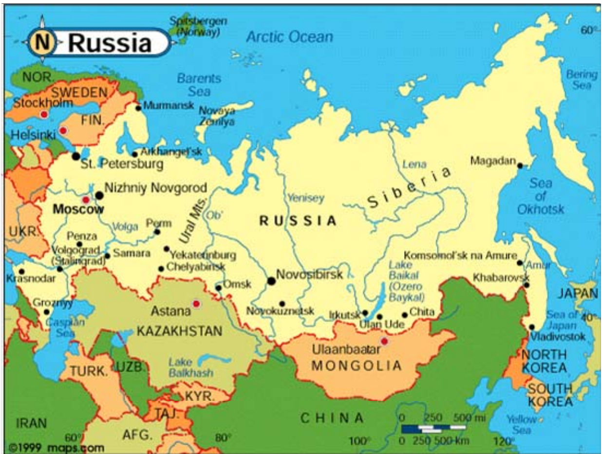
Figure 1. Russian Map

http://us.il.yimg.com/us.yimg.com/i/travel/dg/maps/e5/750x750_russia_m.gif