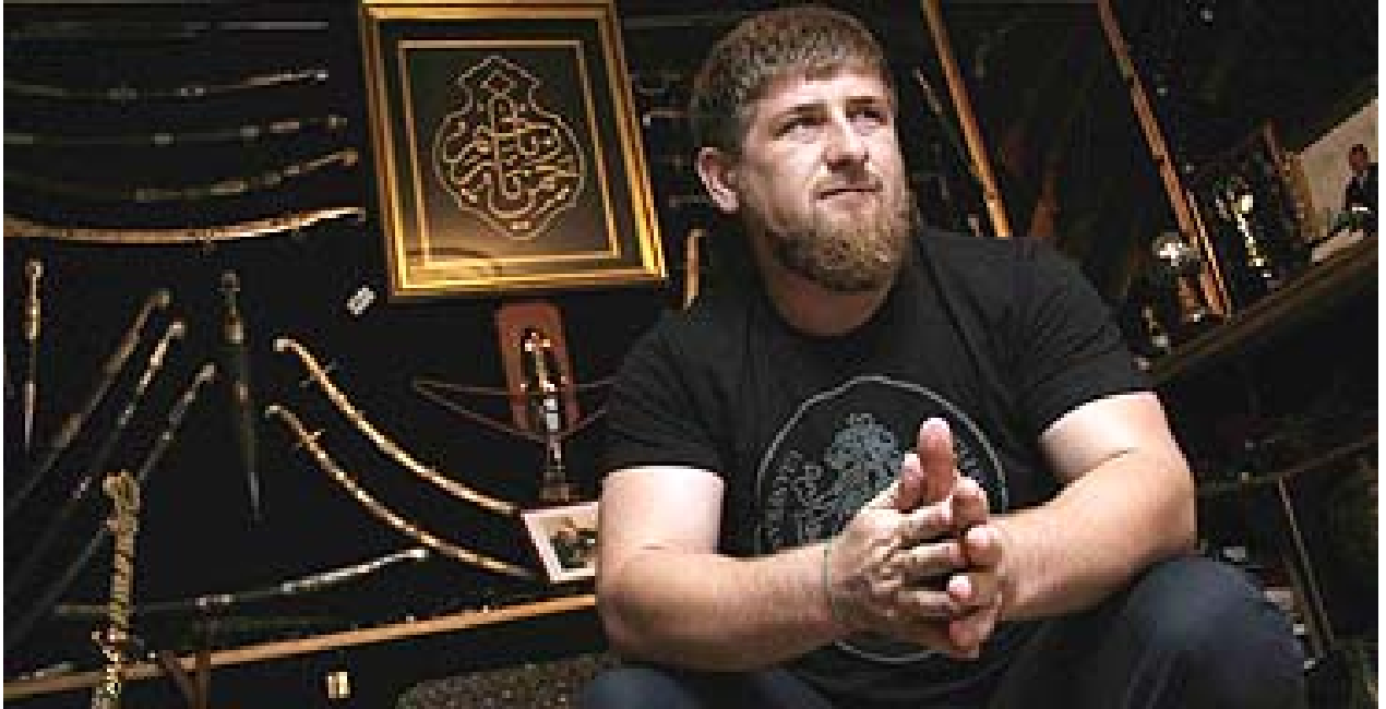
Figure 6. President of Chechen Republic, Ramzan Kadyrov

http://www.guardian.co.uk/chechnya/Story/0,,2214769,00.html