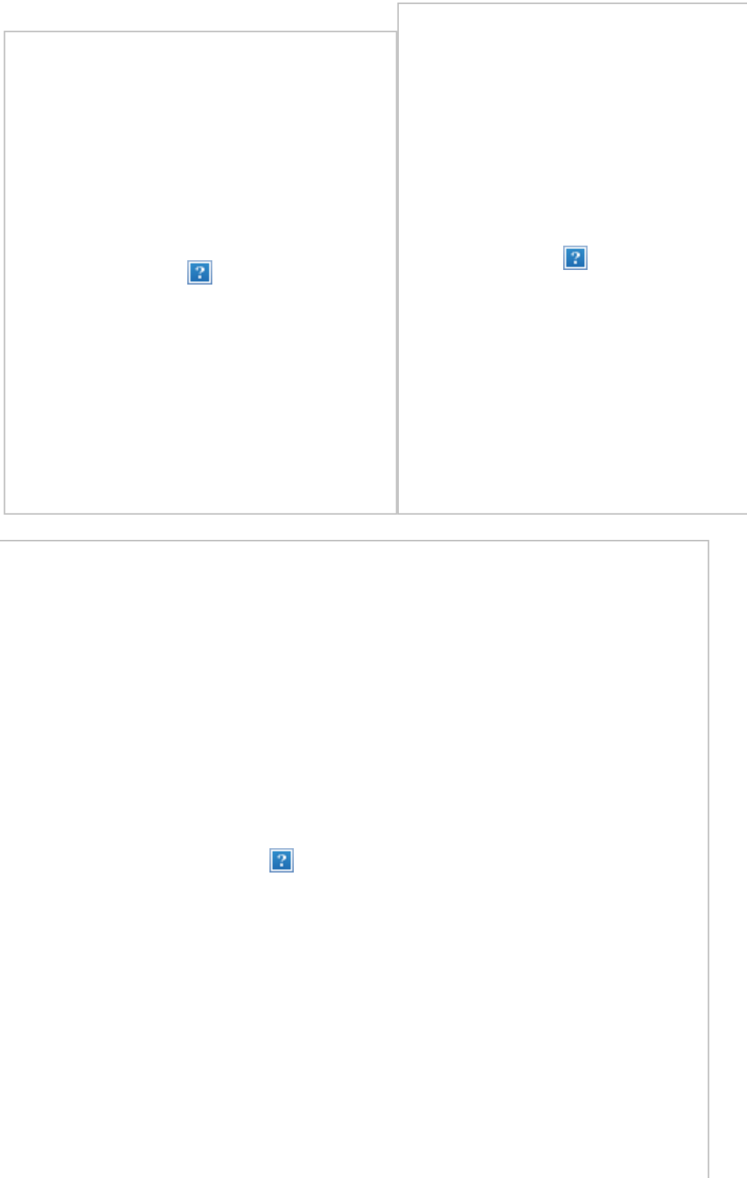
Figure 1: Example from the fake file directory deception.

examines the states resulting from a set of simulation runs of the planner and suggests implications.