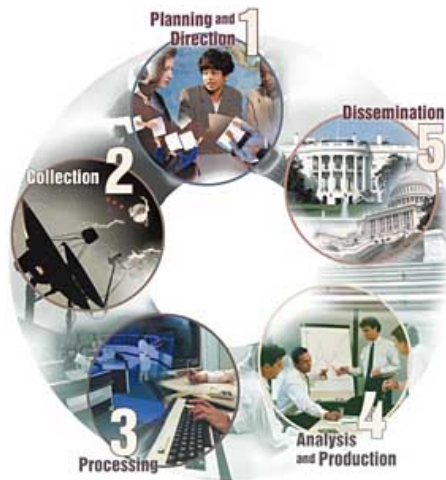
Figure 3. CIA Intelligence Cycle 53