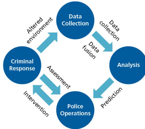
Figure 5. The Prediction-Led Policing Business Process Model, RAND RR233–1.1 62

The terrorist events of 9/11 vastly transformed law enforcement communities across the U.S. and the approach to preventing and combating terrorism that focused on proactive posturing versus reactive engagement. 63 New transnational enemies possibly operating within the homeland in the form of international terrorists and transnational issues, such as narcotics and money laundering have risen in importance becoming more urgent than the previous Cold War era geopolitical concerns. As the intelligence and law enforcement communities have both become increasingly involved in the international aspects of terrorism, drug trafficking, and international organized crime, the National Network is positioned to access the USIC’s considerable wealth of information on these subjects. However, in considering the fulfillment of these capabilities by the HSE, this issue has been the most difficult to resolve. 64