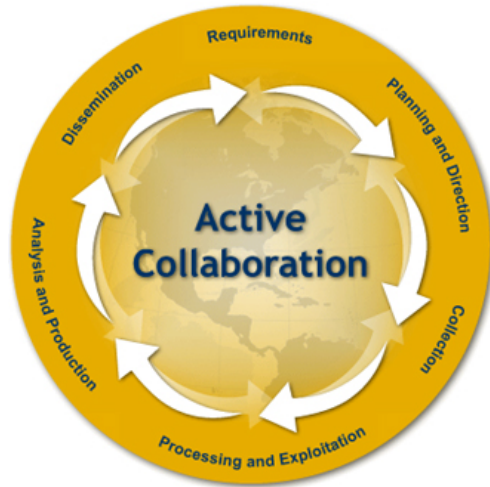
Figure 1. FBI Intelligence Cycle 51