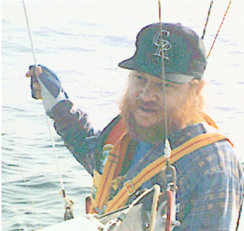
Me, doing what I like best.