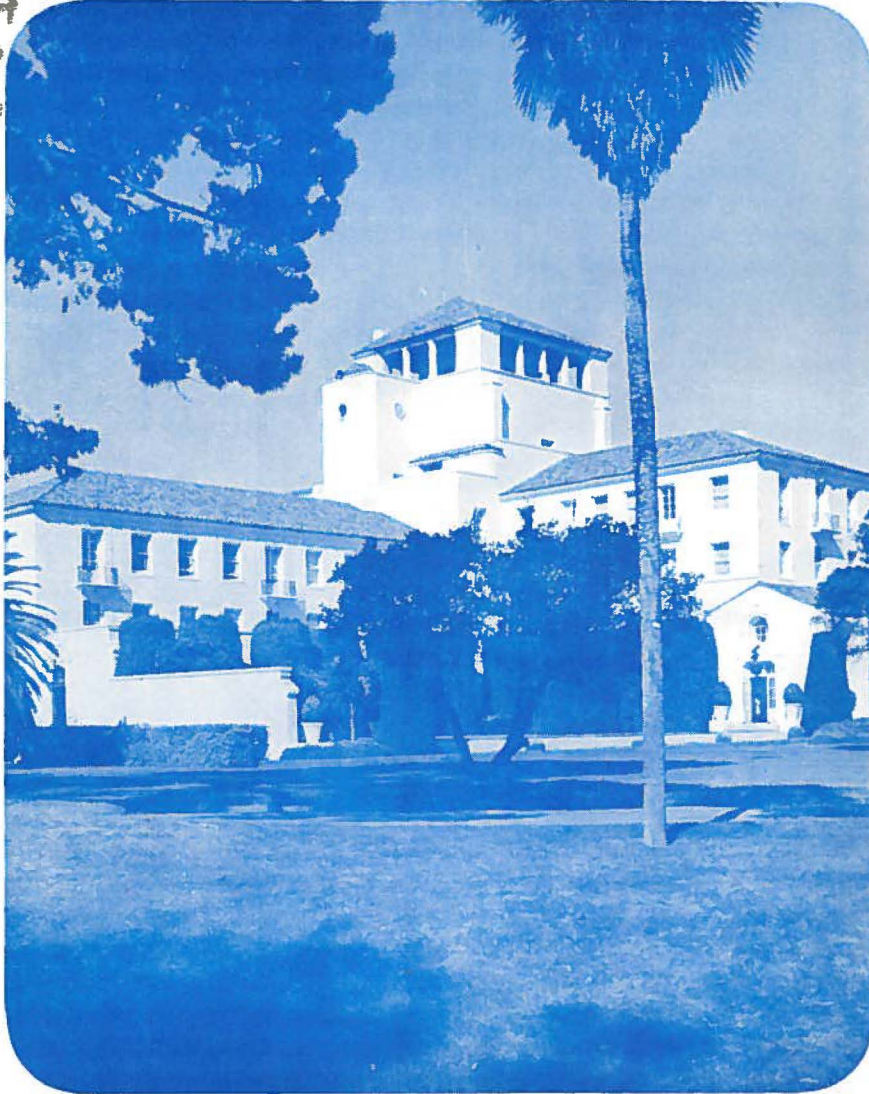
THE ADMINISTRATION BUILDING (FORMER OLD DEL MONTE HOTEL)

DUDLEY KNOX LIBRARY NAVAL POSTGRADUATE SCHOOL MONTEREY, CALIFORNIA 93943