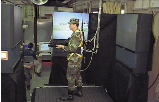
5 NPSNet-IV and the Omni-Directional Treadmill.