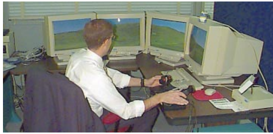
4 Wide field-of-view helicopter navigation trainer.