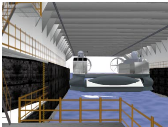
7 Inside the LPD-17 with the amphibious vehicle.