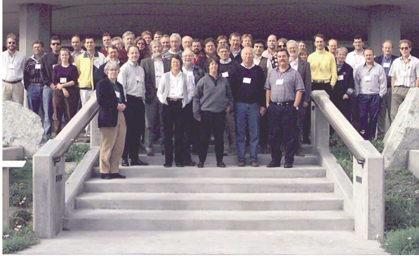
Fig. 1. Photograph of the workshop participants.