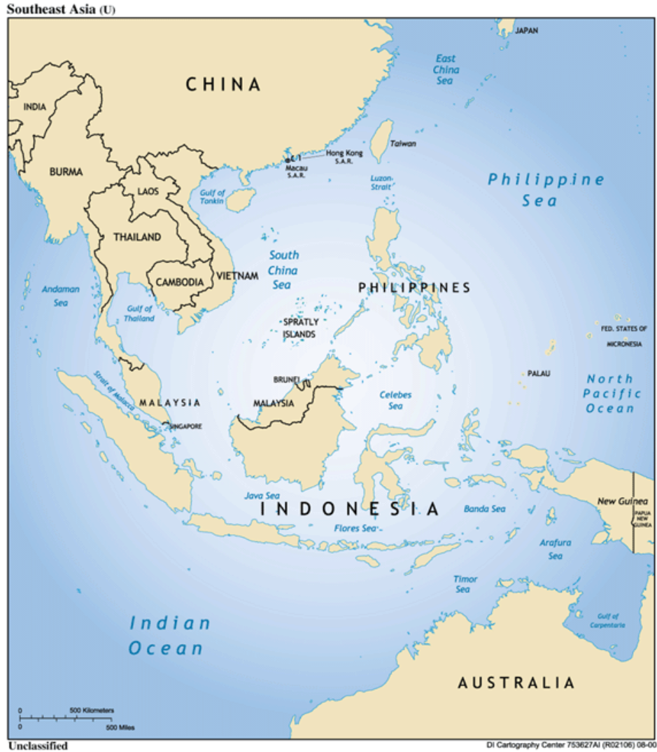
Figure 2. Map of Southeast Asia

The Islamized people of today's Mindanao are the most dominant ethnic group in the Philippines. 24 They include at least thirteen different ethno-linguistic groups. The three largest and most politically dominant are 1) The Maguindanaons, "people of the flooded plains," of the Cotabato Province (Maguindanao, Sultan Kudarat, North Cotabato, and South Cotabato); 2) The Maranaos, "people of