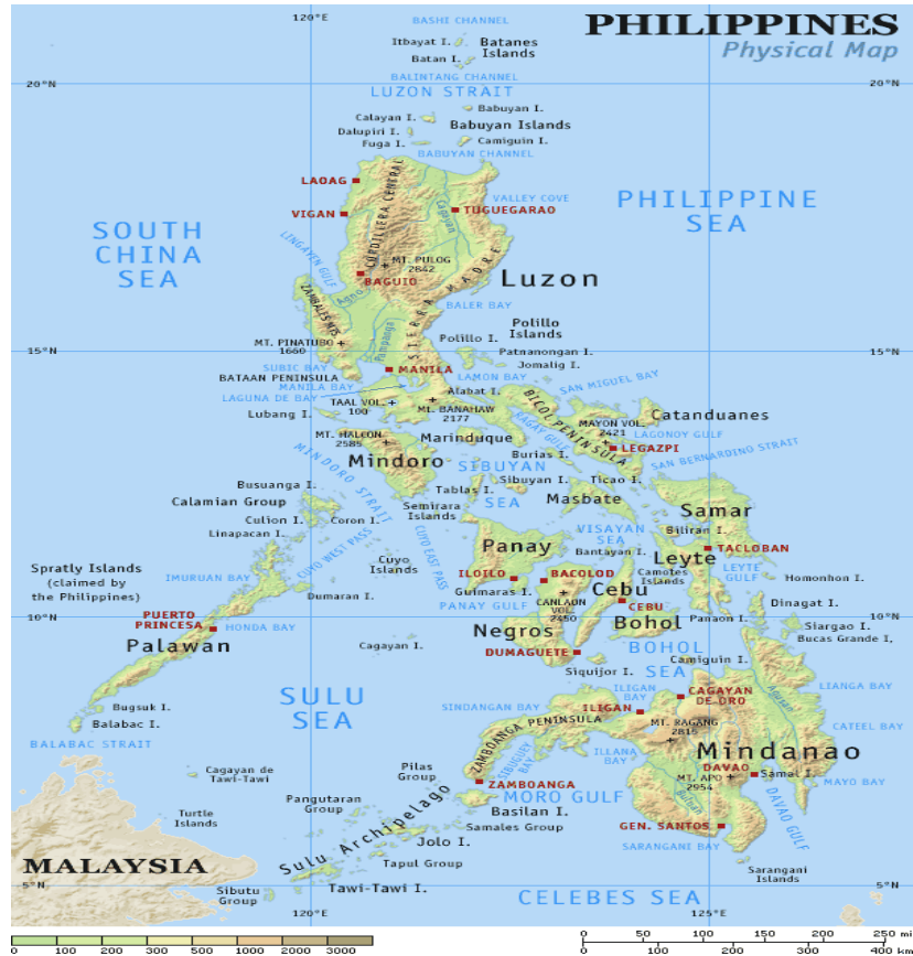
Figure 1. Philippine map.

Map of the Philippines). The MNLF launched an open armed rebellion against the Philippine government to assert Muslim self-determination and to demand an independent "Bangsamoro" 4 state in Mindanao. 5