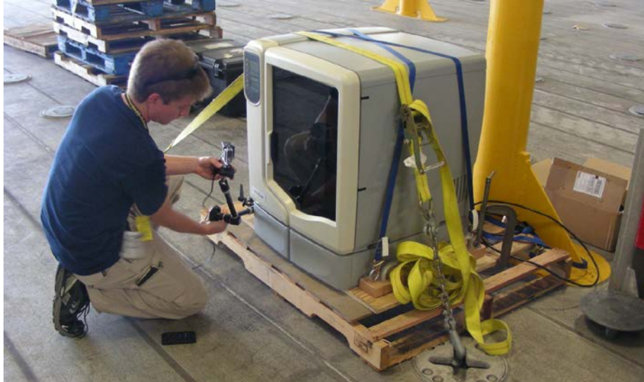
Figure 4. uPrint FDM machine on USNS Choctaw County (from Hess, 2014)