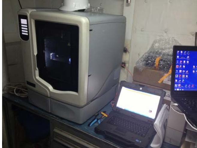
Figure 3. uPrint FDM machine in USS Essex machine shop

FDM machines have been pushed to two ships, the USS Essex (Print The Fleet, 2014) as part of CRIC's PTF initiative and the USNS Choctaw County (Hess, 2014a) for NSWC/ONR testing, in order to trial their suitability for afloat operations. Both installations were carried out for different reasons. The work on JHSV was to quantify the environment and effect on the build quality. This was carried out by installing the system in a cargo area while tests were run on the environmental impacts on the part structure and material properties. The primary objective of the PTF initiative was to put a system on the ESSEX and see what the sailors did with the machine and to socialize the concept (P. Hess, personal communication, November 25, 2014). In this case, it was installed in a machine shop onboard and used by shipboard personnel to experiment with the uses of the technology. While the outcomes of these experiments remain to be published, it is an example of an innovation being actively pushed to an asset for experimentation. In both cases, an uPrint office-size FDM system was used to print polymer parts, one of the simplest and most user friendly large commercial systems in the commercial market.