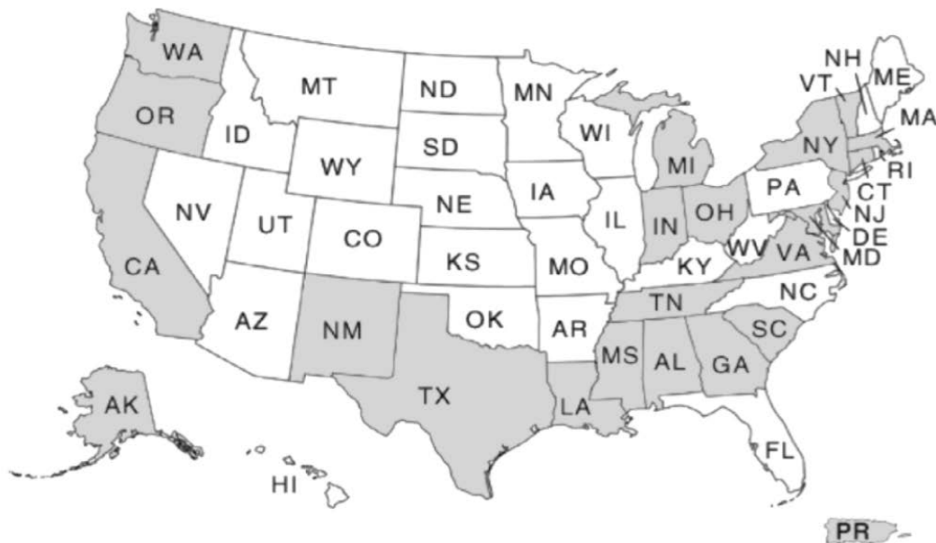
Figure 1. Location of SDFs as of March 2014. 19

Militia, and New Jersey Naval Militia were activated to assist in response measures, recovery efforts, and critical infrastructure security.” 18