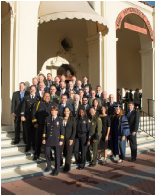
CHDS graduates gather at Hermann Hall prior to their December 18 ceremony.