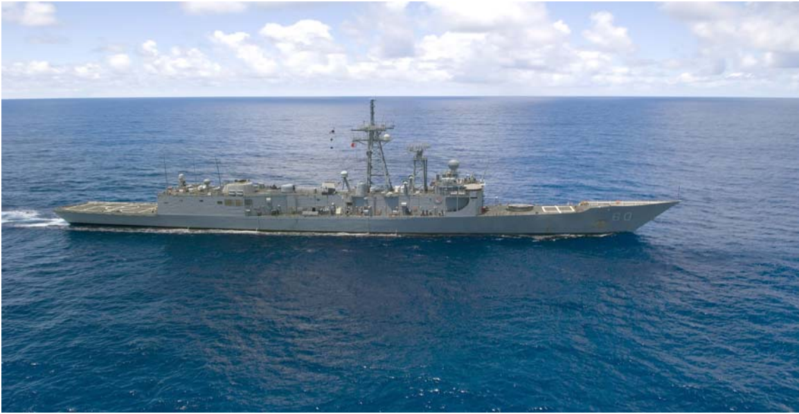
Figure 1. USS Rodney M. Davis (FFG-60) 35