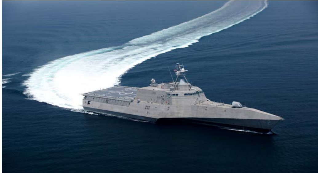
Figure 8. USS Independence (LCS 2) 151

These vessels span 421 feet in length; their beam at the widest breadth is an astounding 103.7 feet, and they have a shallow draft of 14.6 feet. 152 Powering this wide aluminum vessel, the Independence class utilizes a CODAG propulsion system much like its Freedom class counterpart; however, it packs two of its predecessor's (Oliver Hazard Perry frigate) LM2500 gas turbine engines (59,005 HP) in conjunction with two MTU 20V 8000 diesels (25,748 HP), thus propelling it to speeds in excess of 50 knots. 153 Additionally, Table 4 illustrates the Independence class' armament and sensors (without a specified module):