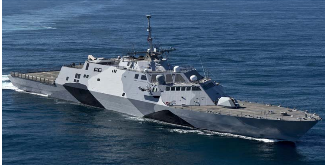
Figure 7. USS Freedom (LCS 1) 145

Additionally, the ship spans 378.3 feet in length, has a beam of 57.4 feet, and a staggering shallow draft of 13.5 feet. 146 To complement its relatively small size, its engineering plant uses a Combined Diesel and Gas (CODAG) propulsion system—powered by twin Rolls Royce MT-30 gas turbine engines (96,500 HP), in addition to twin Fairbanks Morse Colt-Pielstick 16PA6B diesel engines (17,160 HP). 147 Using this hybrid propulsion system, the ship is propelled through the water using four Rolls Royce Kameawa 153SII water jets, enabling the Freedom to operate on either gas turbine or diesel engines at a maximum of 40 plus knots. 148 In addition to its high-powered engineering plant, Table 3 illustrates the Freedom class’ armament and sensors (without a specified module):