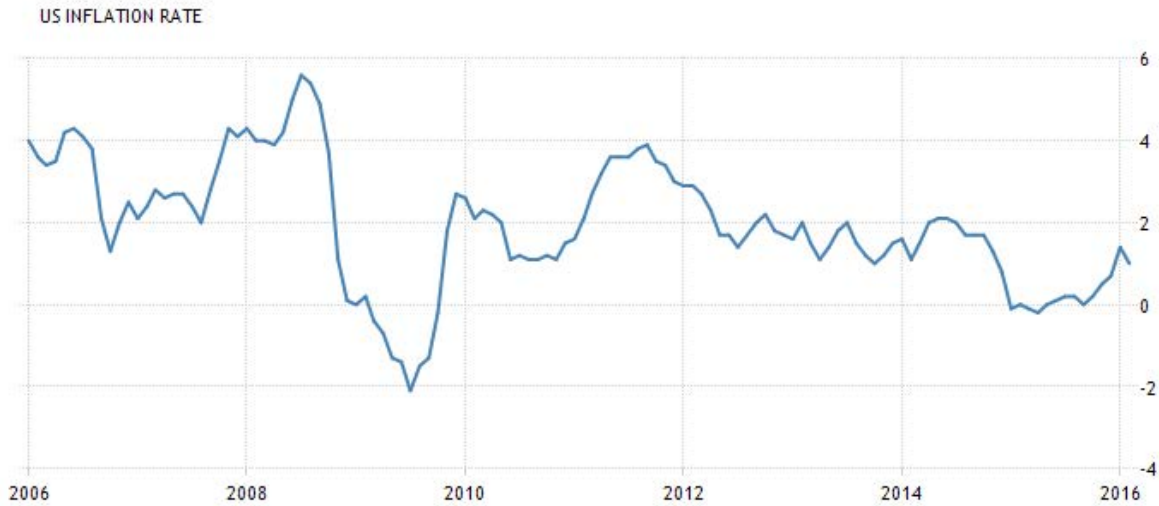
Figure 3. Historical U.S. inflation rates.