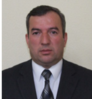
Shavkat Bobozoda Minister of Industry and New Technologies