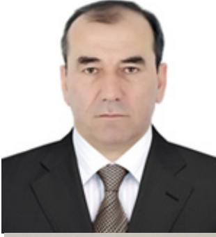
Usmonali Yunusali Usmonzoda Minister of Energy and Water Resources