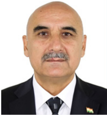
Mahmadoir Zoir Zokirzoda Deputy Prime Minister