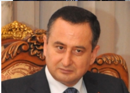
Davlatali Said First Deputy Prime Minister