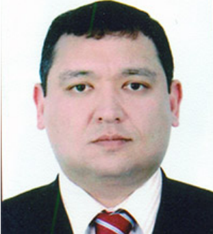
Nematullo Hikmatullozoda Minister of Economic Development and Trade