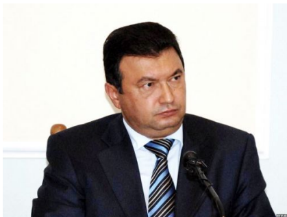
Qohir Rasulzoda Prime Minister