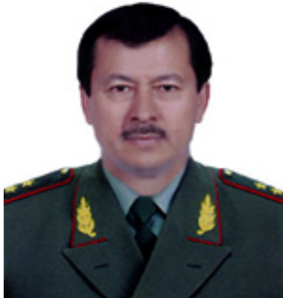
Saymumin Sattorovich Yatimov Chairman of State Committee for National Security