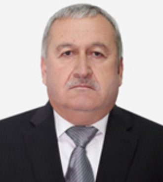
Abdusalom Karim Qurboniyon Minister of Finance