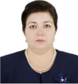
Sumangul Said Taghoizoda Minister of Labor, Migration and Employment