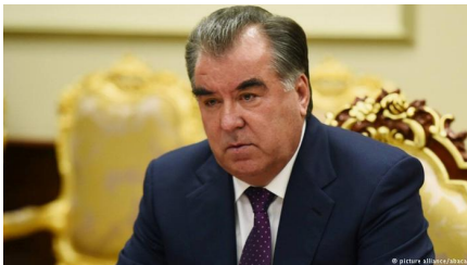
Emomali Rahmon President of Republic of Tajikistan