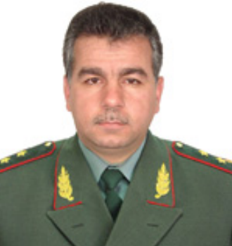
Sherali Mirzo Minister of Defense