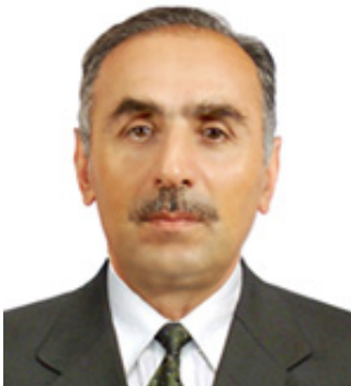
Shamsiddin Shodibek Orumbekzoda Minister of Culture