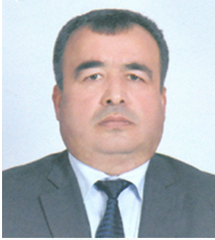
Sherali Ganjalzoda Minister of Transport