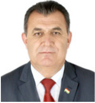
Nuriddin Said Said Minister of Education and Science