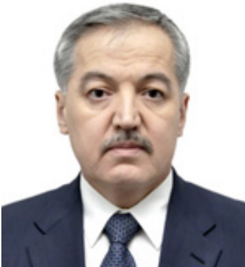
Sirojiddin Muhridinovich Aslov Minister of Foreign Affairs