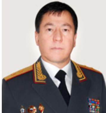
Ramazon Hamro Rahimzoda Interior Minister