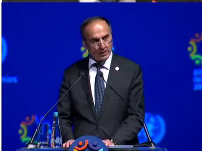
Azim Ibrohim Deputy Prime Minister