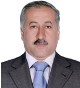
Batyraliev Talantbek Abdullaevich Minister of Health and Social Protection of the Population