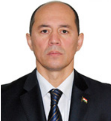
Shohmurod Rustam Minister of Justice