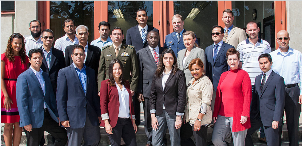
Class Photo: BPEA