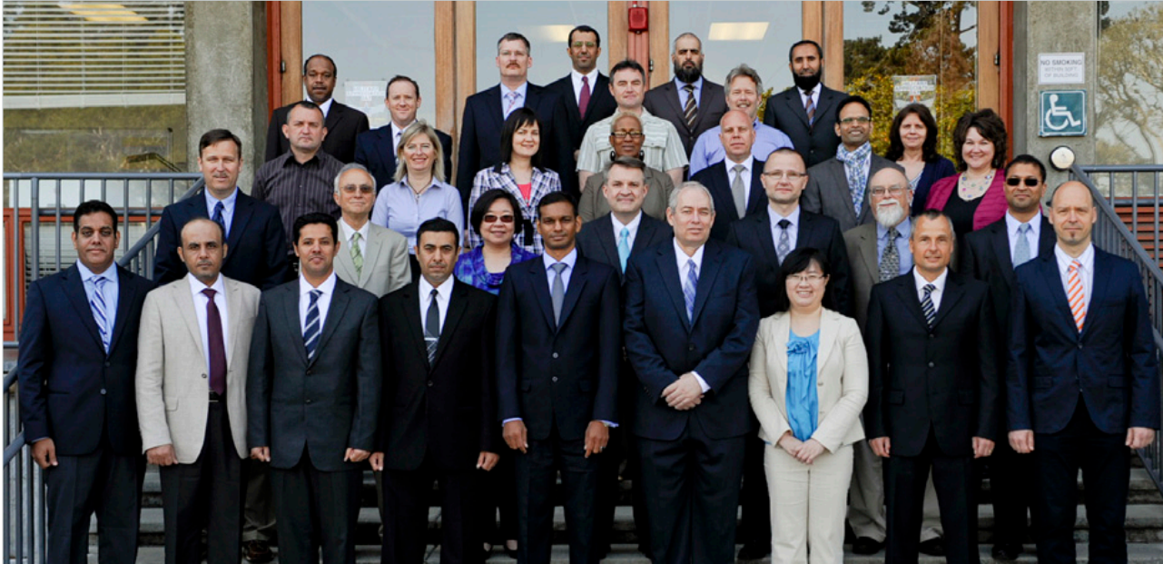
Class Photo: DRMC 14-1