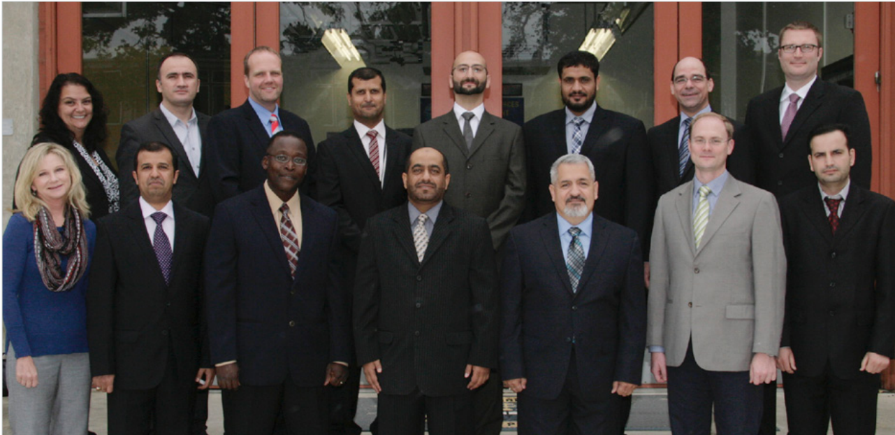
Class Photo: DRMC 14-2