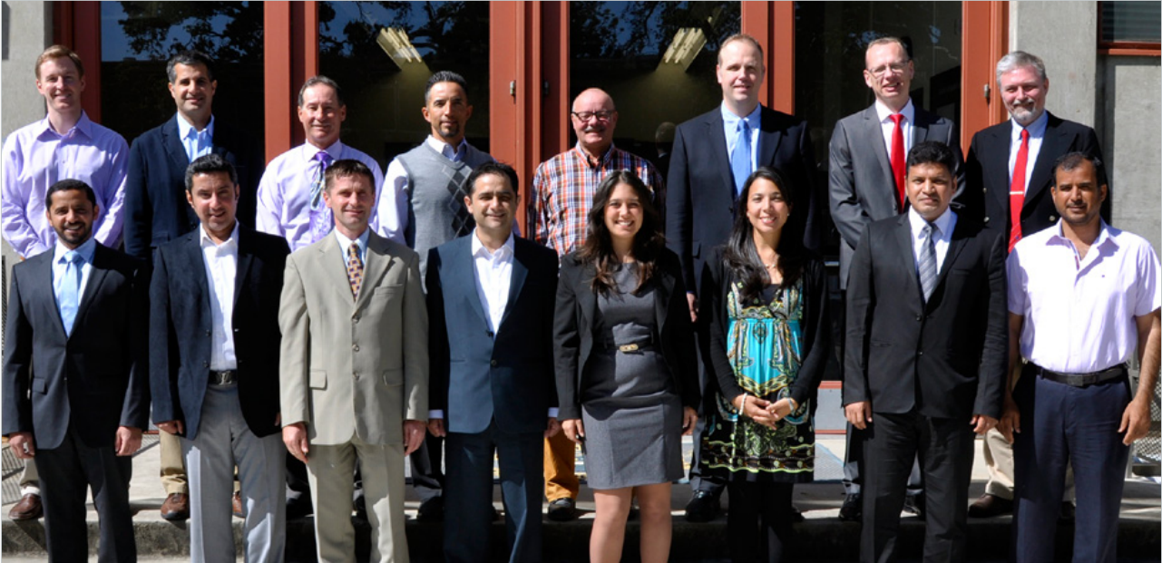
Class Photo: RISK 14-2