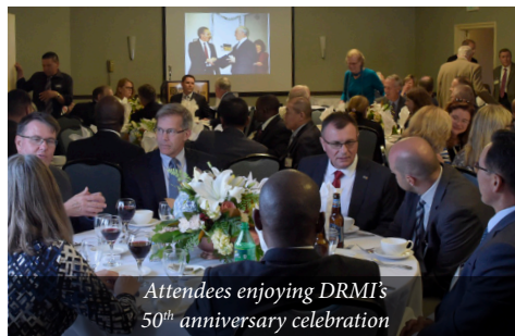
Attendees enjoying DRMI's 50 th anniversary celebration