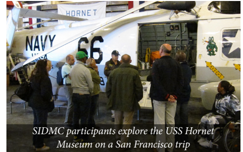
SIDMC participants explore the USS Hornet Museum on a San Francisco trip

DRMI faculty planned multiple events to facilitate and encourage relationship-building among SIDMC participants—an integral part of all DRMI programs with international participants.