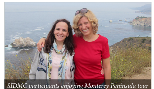
SIDMC participants enjoying Monterey Peninsula tour

Additionally, the FSP and DRMI held two cross-cultural dinner receptions at the Hilton Garden Inn. In the first reception, fifty-five Foreign Area Officers (FAOs) and their equivalents who volunteer with DRMI's FAO-Cultural Ambassador Program (FAO-CAP) interacted with SIDMC participants, making this the most well-attended FAO-CAP security cooperation event to date. The FAO-CAP aims to connect FAO students