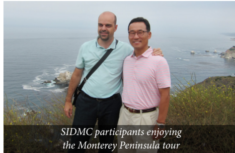
SIDMC participants enjoying the Monterey Peninsula tour