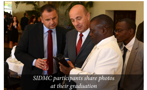
SIDMC participants share photos at their graduation

D RMI once again would like to extend its congratulations to the 46 th annual SIDMC participants. We certainly enjoyed welcoming you to Monterey and we have appreciated your hard work in the classroom. We do hope that you will remain in touch. As we always say at DRMI, until we meet again.