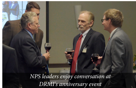
NPS leaders enjoy conversation at DRMI's anniversary event