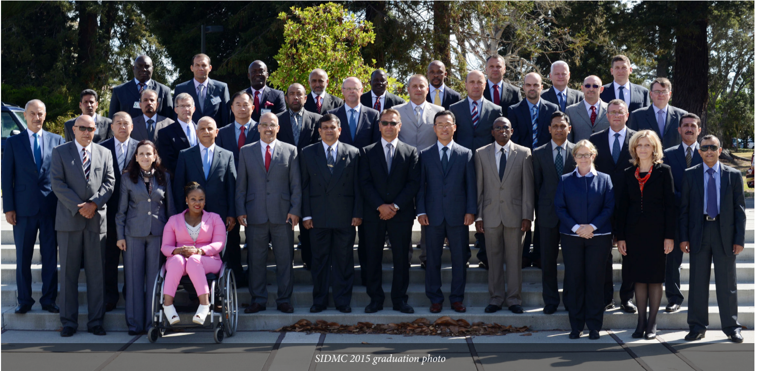
SIDMC 2015 graduation photo