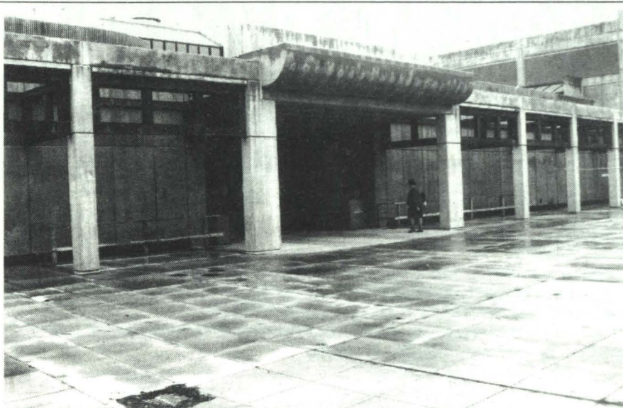
The Dudley Knox Library will be closed Saturday and Sunday. The library, along with other areas in the academic quadrangle, will be without power due to construction work.