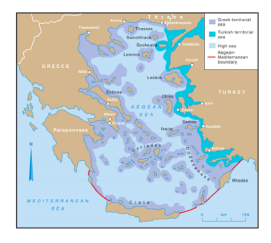
Figure 1. Current Territorial Sea Distribution in the Aegean (six nautical miles).<sup>58</sup>

Turkey maintains the position that extension of the territorial seas is unacceptable as all shipping to and from Turkey's Aegean ports and, indeed, that any transiting of the Turkish straits to and from the Black Sea requires one to pass through Greek territorial waters. Pointing out that Turkey itself has extended its territorial seas to twelve nautical miles off its Black Sea and Mediterranean coasts, Athens stresses the fact that the navigation rights, covered by the right of "innocent passage" laid down in the 1982 UN Convention, would not be threatened by an extension of Greek territorial waters to twelve nautical miles. As the breadth of the territorial waters impacts the ownership claims of the continental shelf beneath them and the airspace above them, Greek security analysts consider this challenge part of Ankara's overall revisionist aspirations in the Aegean.