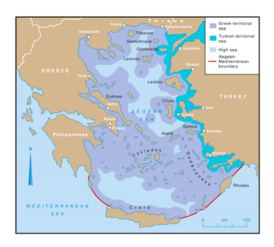
Figure 2. Possible Territorial Sea Distribution in the Aegean (twelve nautical miles).<sup>59</sup>