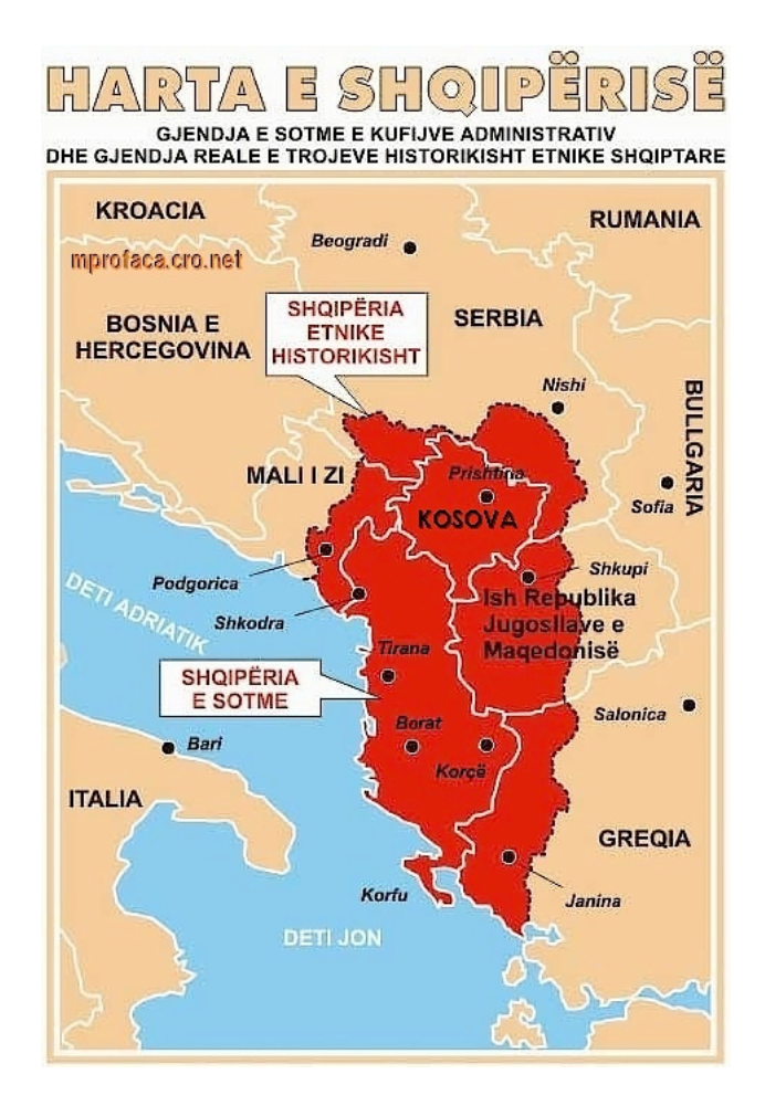
Figure 3. Albanian Map Depicting the Borders of "Great Albania." 79

as part of this agenda seeks political control over part of Epirus—the northwestern region of Greece—claiming it to comprise an organic part of the Great Albania.<sup>78</sup>