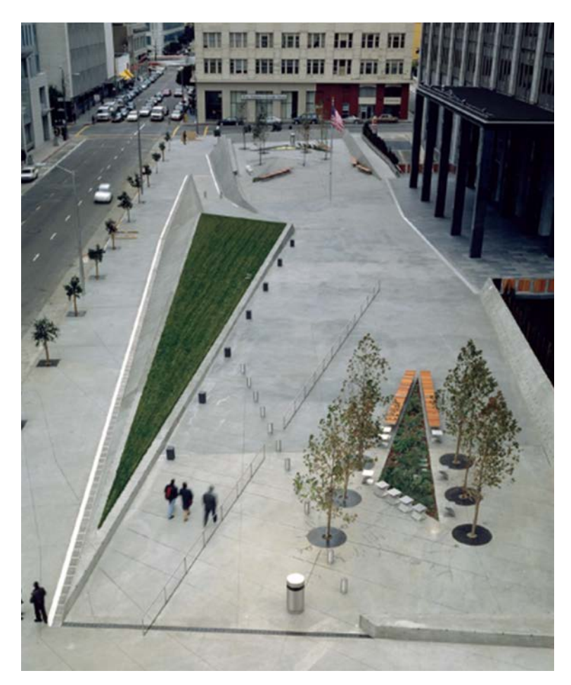
The pedestrian plaza serves the dual purpose of homeland security and architecture.

terrorist attack. Benches and large logs encourage the public to linger and enjoy the open space (see Figure 18).