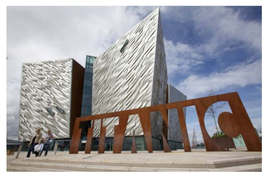
The museum grounds include a series of wide stairs leading to a plaza with a large art piece spelling "Titanic." The steps and artwork are designed to prevent a vehicle-borne terrorist attack.

Figure 21. Homeland Security Architecture at the Titanic Museum in Belfast<sup>146</sup>