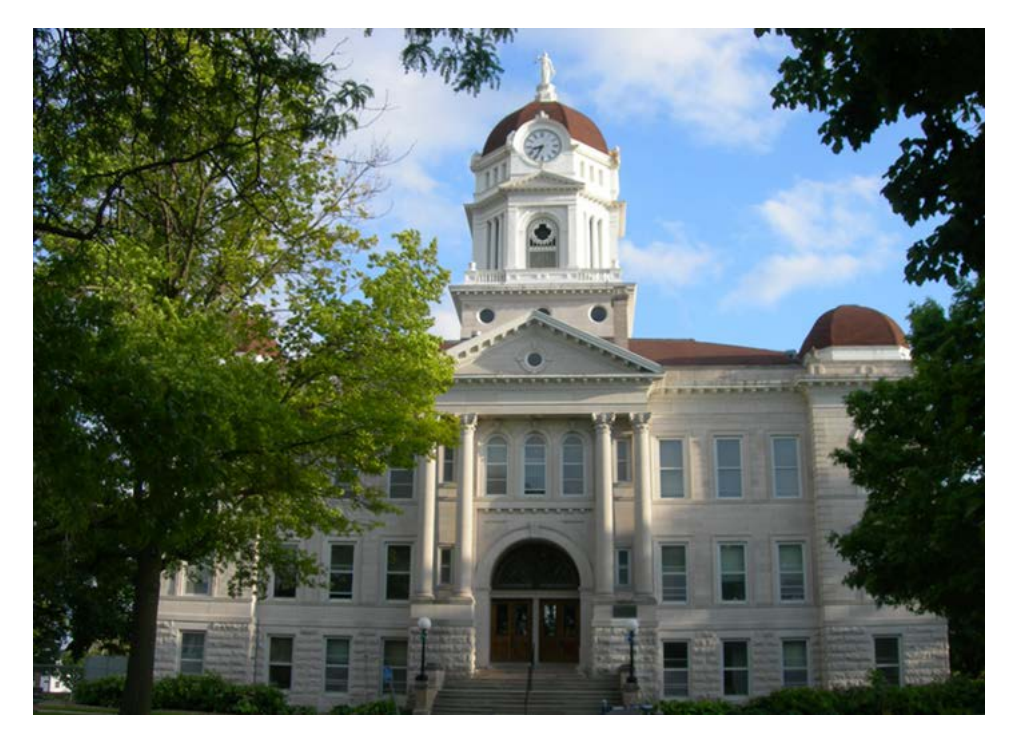
Built circa 1908, the courthouse has a welcoming, opening space leading to wide stairs and large double doors. Multiple windows imply transparency, while the dome implies heavenly work occurs in the building.

Figure 6. Hancock County Courthouse in Cathage, Illinois<sup>59</sup>