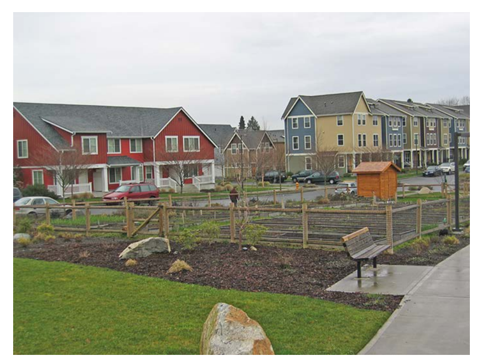
This aesthetical urban village combines single-family homes, duplexes, and apartments around community gardens and parks a short distance from downtown. The neighborhood design encourages a resilient and healthy community.

Figure 11. High Point Neighborhood in Seattle, Washington<sup>105</sup>