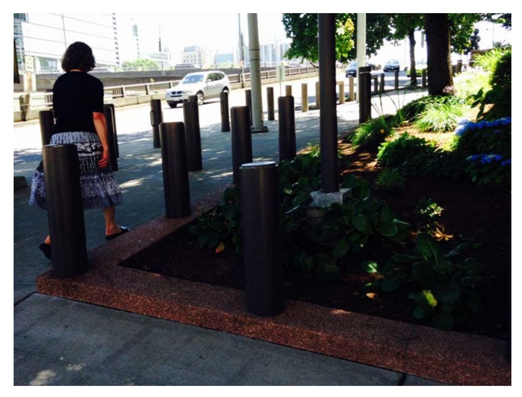
This courthouse shows an example of homeland security architecture added to the public sidewalks of an urban setting. The abundance of security bollards compromises the aesthetics of the public spaces.

Figure 7. Federal Courthouse in Seattle, Washington<sup>78</sup>