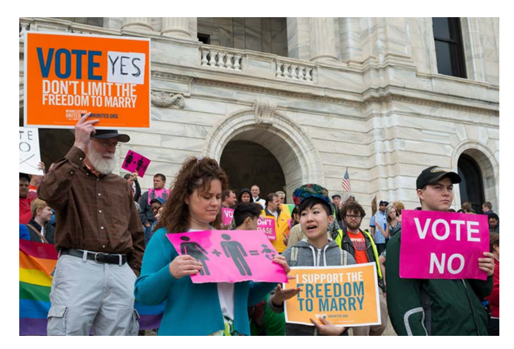
Figure 3. Marriage Equality Act Supporters and Protestors Exercising First Amendment Rights at a St. Paul, Minnesota, Court House in 2013<sup>51</sup>