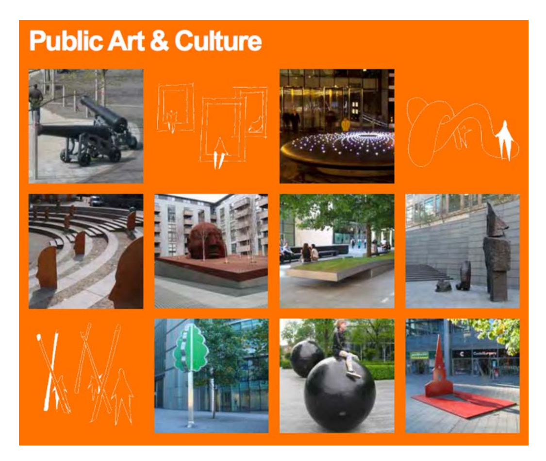
Figure 25. Art Installations as Potential Homeland Security Architecture<sup>164</sup>