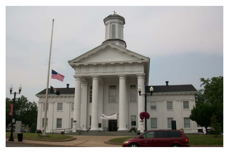
Built circa 1849–1850, the large doric columns create a grand portico where citizens can gather. The facade contains an octagonal cupola and a double row of sash windows.

means of communication analogous to verbal or written language."<sup>56</sup> Public buildings across the country were built in the Greek revival and neoclassical style characterized by grand entrances, soaring Greek columns, lofty domes, and facades filled with windows (see Figures 5 and 6). The style of Greek revival and neoclassical architecture "is looked on as the expression of local nationalism and civic virtue."<sup>57</sup> The political messages communicated by these grand public buildings show that America is a proud and enlightened country with a political system whose roots can be traced back to the ancient Greeks. America welcomes and encourages her citizens to actively participate in their government—a government Abraham Lincoln famously described in the Gettysburg Address as being created by the people and for the people.