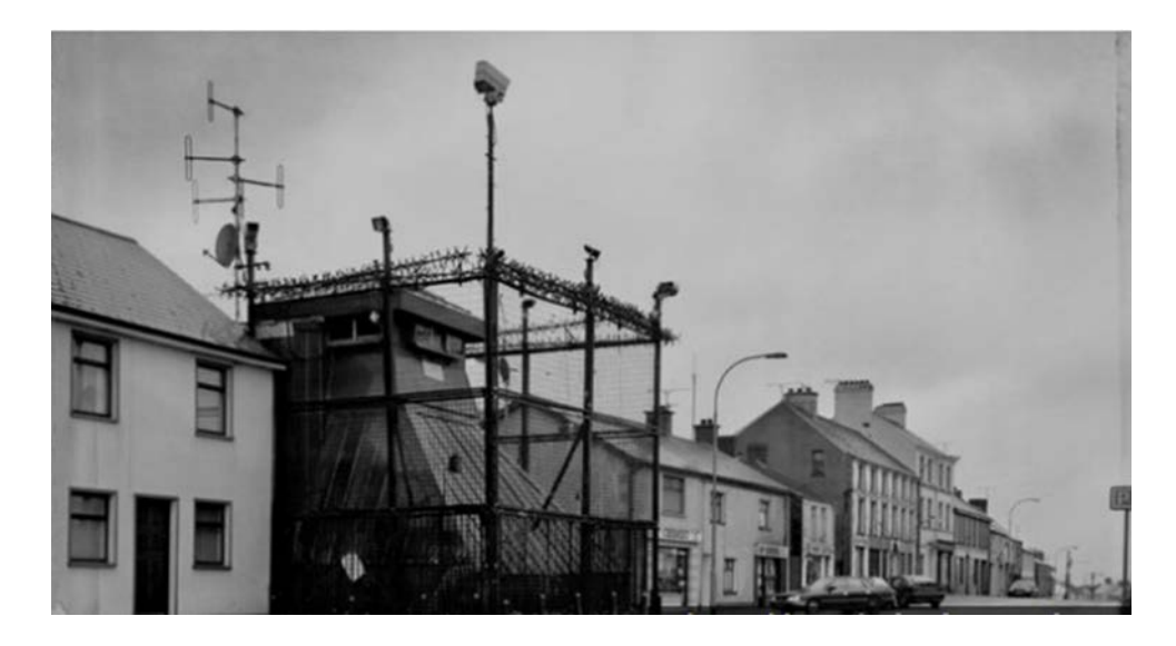
Figure 19. Heavily Fortified British Watchtower Contrasting with Crossmaglen Neighborhood Buildings<sup>143</sup>