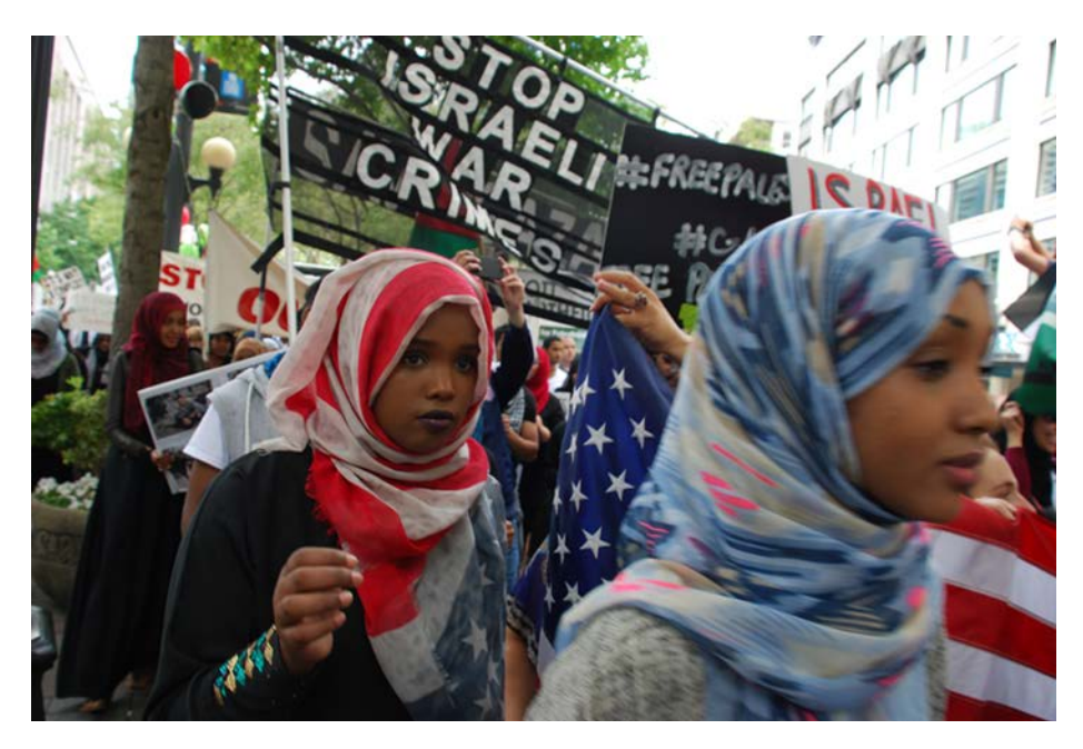
Figure 4. 2014 Protest against the Israeli Invasion of Gaza at Westlake Park in Seattle, Washington<sup>52</sup>