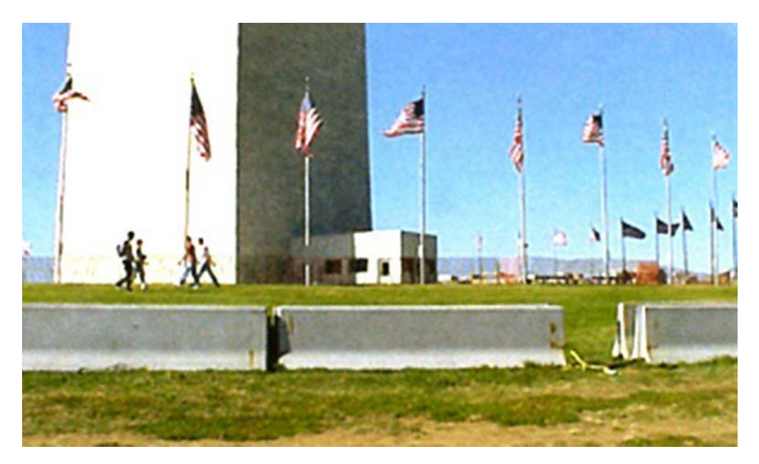
The concrete jersey barriers were used to create an ad-hoc security perimeter.

Because the ASLA took an early and active lead in security design, it appears to be the most successful of the three associations in blending aesthetics and homeland security architecture. One of its most notable landscape architecture projects was the redesign of the Washington Monument's grounds. Prior to the redesign project, the concrete jersey barriers used as a security feature marred the beauty of the monument (see Figure 13). The grounds of the monument were re-contoured and new landscaping, lighting, and low granite seat-walls were installed around the site. The new walls create a welcoming spot for visitors to sit and view the sweeping landscape, while also acting as a barrier to vehicle-bourne explosive devices (see Figure 14).