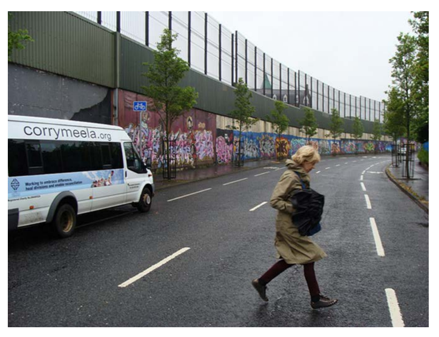
Known as peace walls, these security barricades separate Catholic and Protestant neighborhoods in northern Ireland in 2013.

Figure 20. Northern Ireland Peace Walls<sup>144</sup>