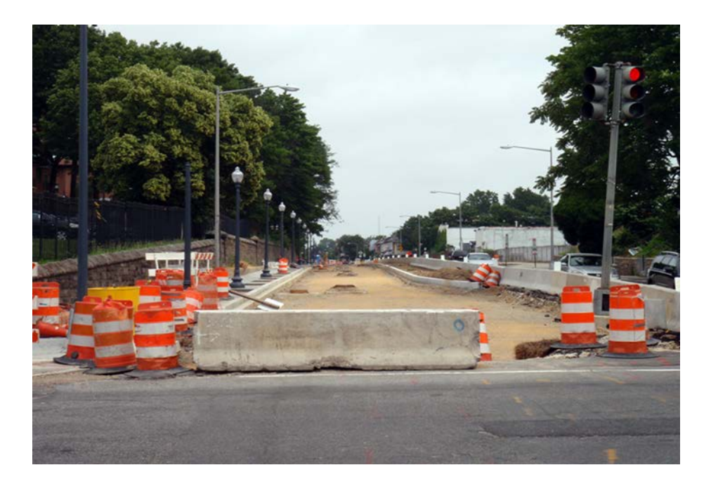
Figure 2. Temporary Concrete Barriers and Orange Plastic Traffic Barrels Used to Redirect Traffic for a Transportation Project in Washington, DC<sup>40</sup>