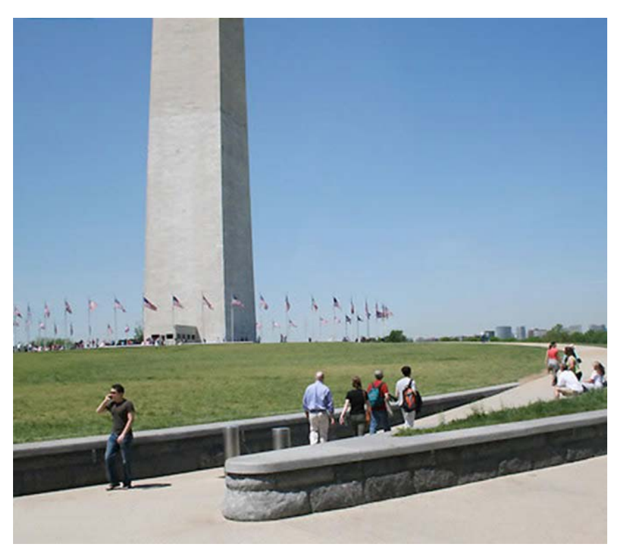
Granite "ha ha" walls, traditional low walls used to contain grazing animals, can stop hostile vehicles while also providing public seating. Like with the new embassy in London, grass-covered slopes partially achieve site security.

Figure 14. Washington Monument after Landscape Architecture Redesign<sup>119</sup>