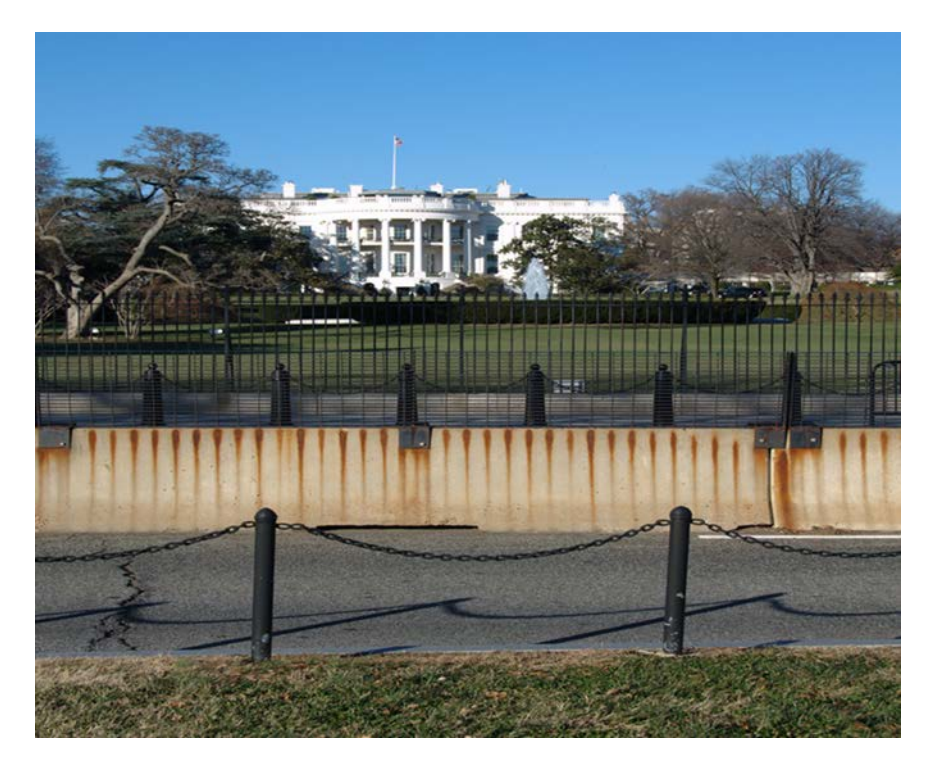
Figure 16. Homeland Security Architecture, Including "Temporary" Concrete Jersey Barriers, in front of the White House in December 2010<sup>130</sup>