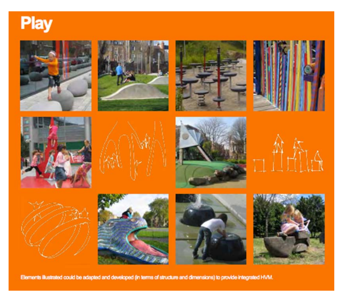
Figure 26. Urban Play Areas as Potential Homeland Security Architecture<sup>165</sup>

The options for homeland security architecture presented by CPNI offer perhaps the greatest possibility for enhancement to the public realm. Fortunately, most public spaces will never experience a terrorist attack. Thus, homeland security architecture that contributes to the aesthetics of the public realm and enhances a space for everyday use becomes a greater investment in the space than a design that servers no other function beyond security. Public agencies like NaCTSO and CPNI, by partnering with private agencies, help ensure public spaces in the United Kingdom get the maximum benefit from homeland security architecture.