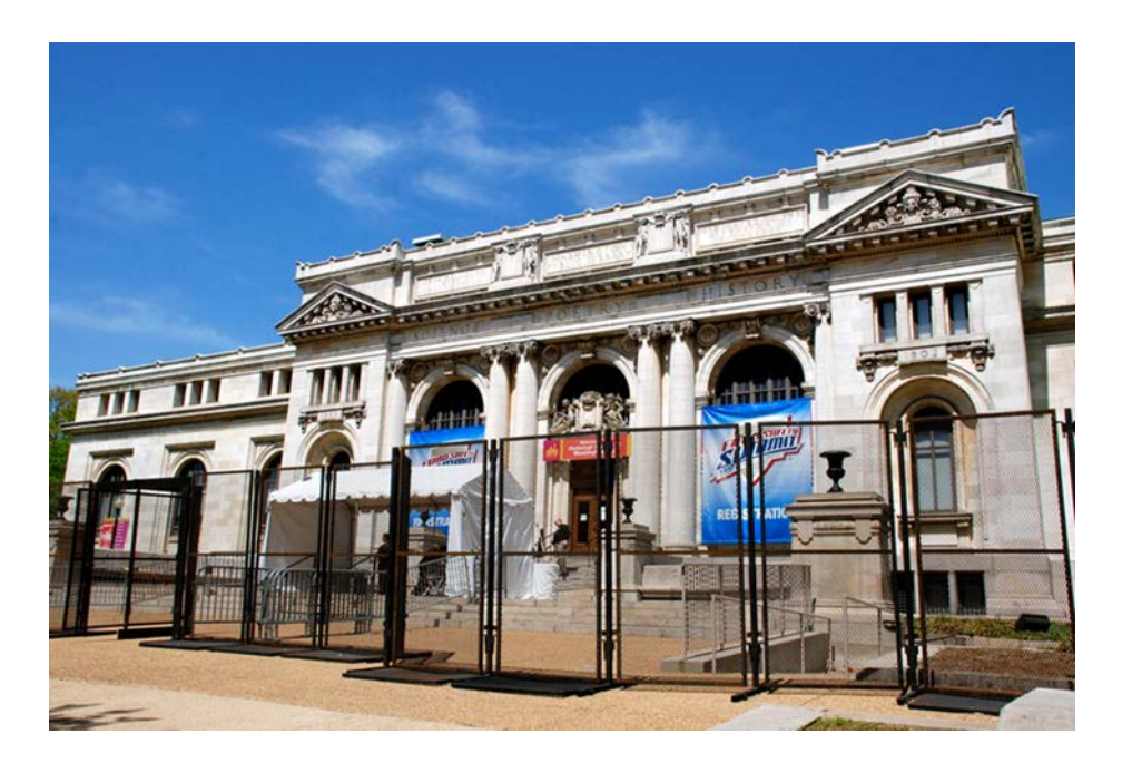
Figure 15. Representation of Temporary Security Barriers at the Historic Carnegie Library in Washington, DC, 2010<sup>129</sup>

This first guide provided recommendations for meeting homeland security architecture requirements at specific locations, such as on Pennsylvania Avenue from the White House to the Capitol Building. The guide's recommendations intended to help project applicants meet the regulatory requirements enforced by the NCPC while meeting the new security needs post-9/11. By convening a task force of subject-matter experts representing security, urban design, architecture, historic preservation, and fine arts fields, the guide provided a balanced approach between aesthetics and security for the public sector.