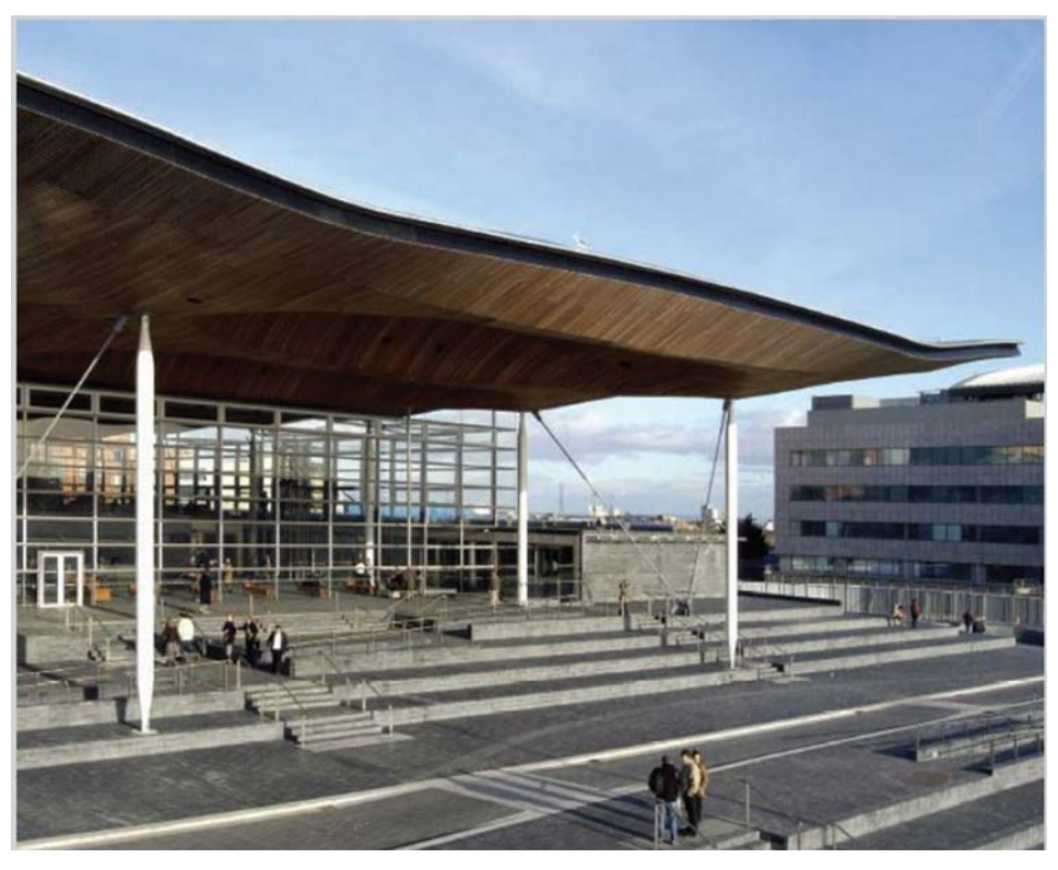
The building has a large public plaza that doubles as homeland security architecture, and walls of windows in the building's reception area suggest transparent governance.