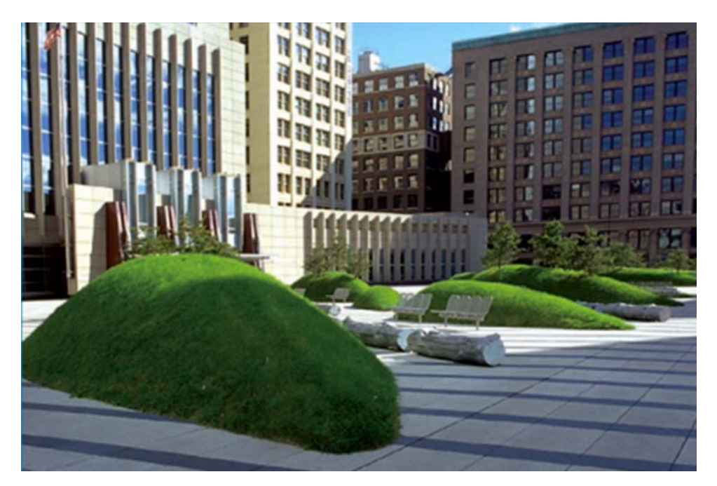
The plaza has planted berms, large logs that double as public seating, and an overall urban park-like feel.