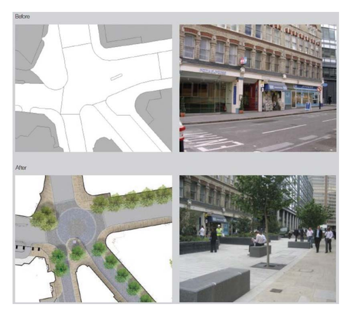
Figure 24. Improved Corporation of London Streetscape<sup>153</sup>

depressed area, the improved grounds offer new pedestrian-only boulevards supporting sidewalk cafes, restaurants, and bars (see Figure 24).<sup>152</sup>