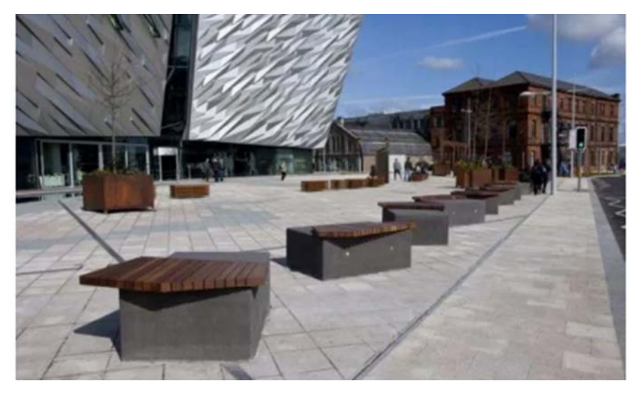
Figure 21. Homeland Security Architecture at the Titanic Museum in Belfast<sup>146</sup>

The plaza is designed with granite block homeland security architecture featuring wood seating reminiscent of ship decking.