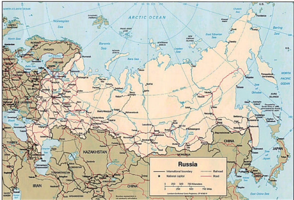
Figure 1. Map of Russia 1994

It is not unfair to ask, given Russia’s geographic enormity, what European security has—if anything—to do with Vladivostok in the Far East, or the Kuril Islands dispute with Japan. (The latter, incidentally, would violate the principle for NATO membership that “external territorial disputes . . . must be settled by peaceful means in accordance with OSCE principles.” 115 )