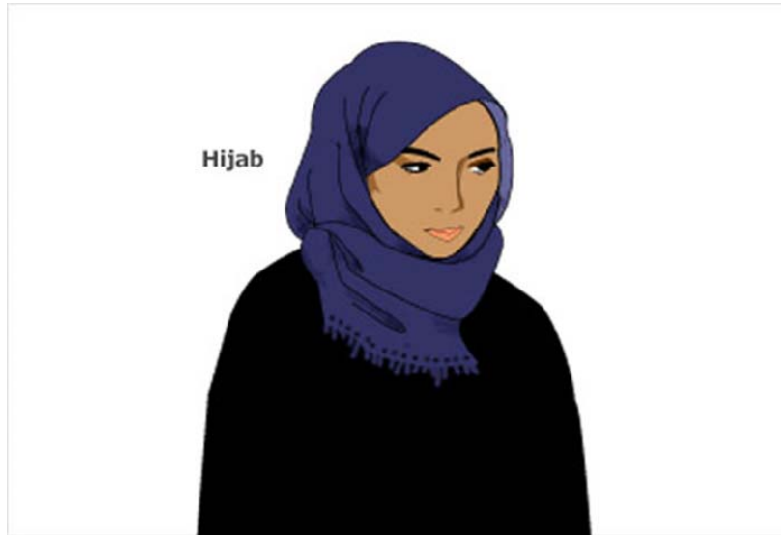
Figure 1. Hijab. 46

that covers the whole body of a woman, and has a mesh area for her eyes so she can see. The choice of cover depends on the country of origin of the wearer; each culture has its own interpretation of this passage.