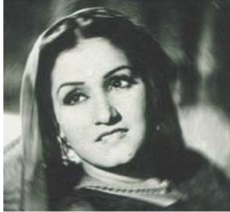
Figure 3. Hindi actress Noor Jehan wears the dupatta in the 1955 film “Dupatta.” 52

As the meaning of hijab continues to morph and develop throughout the world, it is clear that British Muslim women are struggling with the identity that it associates them with. The Islamic concept of the ummah- or entire Muslim population- hypothetically allows a Muslim woman to feel at home with other Muslims in any setting, as religion knows no borders or nation. Wearing the hijab associates women with birthplace of Islam and Arabic, the Middle East, shifting identity away from South Asian and toward the universality of Islam. 53 Young women are wearing veils in Great Britain as a sign that they are visibly Muslim, a global citizen, as well as British.