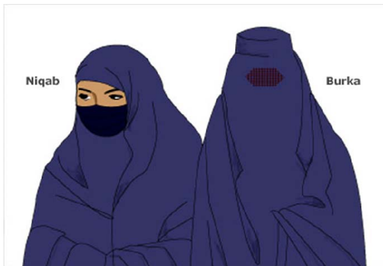
Figure 2. The Niqab and Burka. 47