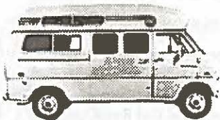
Custom D. Ideally suited for the family who wants to use it for a first or second car. Valued below many station wagons at $5495.00.