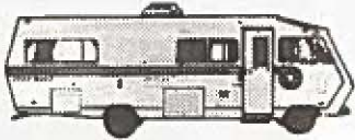
25' Statesman, completely self-contained with generator. 2 A/C units, many, many, other options. $14,995.