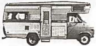
Westwood Model. Beautifully self-appointed compact mini-motor home, with all of the normal conveniences. A test drive will convince the family. $6995.00.