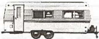
Belmont Travel Trailer. Tandem wheels makes this model very desirable for those who don't want to lose the use of their car. Open Roads most desired unit at $2695.00.