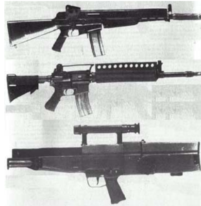
Figure 2-2 Prototype ACRs

Concurrently and as a result of NATO munitions standardization, requirements developed by the Marine Corps and the United States Army Infantry Center, Ft Benning, GA (USAIC) led to the development of the M16A2. M16A2 improvements included a redesigned barrel to support firing a heavier projectile, improved sights and integral provisions for left-handed firers. Due to munitions and weapon enhancements, the rifle's range increased to 800 meters from 300 meters.