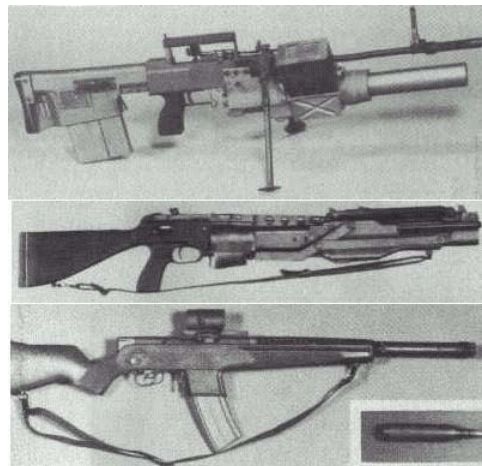
Figure 2-1, Prototype SPIWS

In 1963, the DoD announced the purchase of the AR15 as an interim measure. Meanwhile, the follow-on to the LWR was the Special Purpose Individual Weapon (SPIW) program. This effort pursued the possibility of a small caliber "flechette" 1 round for use in a military rifle. After extensive development and testing, no SPIW prototypes could attain reliability, durability and weight requirements. In 1966, the Army