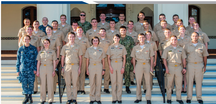
In addition to the Bowman scholarship, two new programs for newly-commissioned Navy Ensigns, the Shoemaker scholarship and a new opportunity for aviators, have made the current cohort of Ensigns on campus one of the largest ever.

In addition to the Bowman scholarship, two new programs for newly-commissioned Navy Ensigns, the Shoemaker scholarship and a new opportunity for aviators, have made the current cohort of Ensigns on campus one of the largest ever.