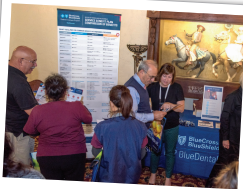
The Human Resources Office hosted a federal health fair in the La Novia Room, Nov. 6. The health fair brought together representatives from the major health, vision and dental insurers that have contracted with the federal government to provide benefits to federal employees.