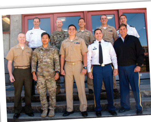
Naval War College (NWC) Monterey students earning academic honors during the 2018 Summer Quarter are pictured following a brief ceremony in their honor near the NWC Monterey program offices in Halligan Hall, October 30.