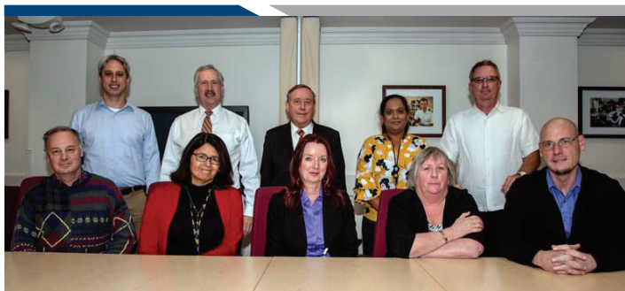
Members of the Inclusion and Diversity Council (IDC) are introduced to NPS senior leadership at the IDC's inaugural meeting and official launch, Nov. 8. The IDC focuses on monitoring trends, providing recommendations, and serving as a link between NPS senior leadership, management and employees, on all matters relating to inclusion and diversity.

As the IDC looks ahead to its next meeting, they plan on reviewing initial data, surveys and reports that the council members have access to as a starting point for identifying which inclusion and diversity issues and concerns are the most relevant and pressing to address.