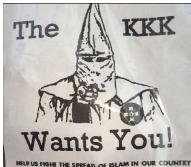
Figure 4. KKK’s Remake of a WWII Recruitment Poster 292

FBI released new statistics that revealed 6,121 hate crime incidents, of which over 57 percent were motivated by race, ethnicity, or ancestry. 289 Additionally, a recent FBI report indicates that hate crimes targeting Muslims and/or people believed to be Muslim grew by 67 percent between 2014 and 2015. 290 In December 2015, following the Daesh-inspired attacks in Paris and San Bernardino, the Ku Klux Klan (KKK) recruiters sent flyers out to people in Alabama recruiting members and encouraging like-minded Americans to stop “The Spread of Islam” (see Figure 4). 291