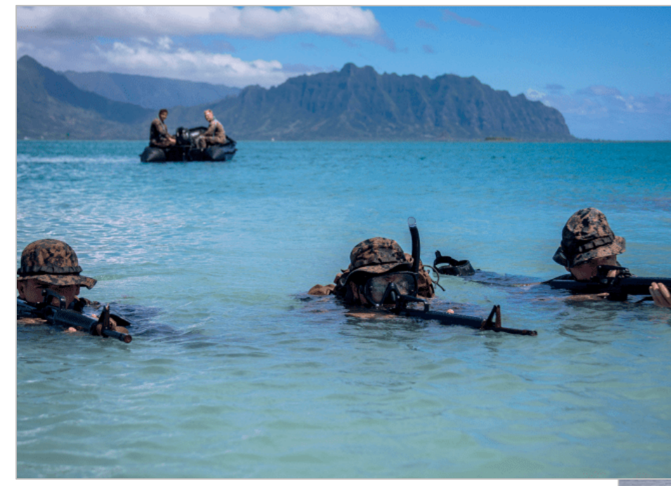
U.S. Marine Corps reconnaissance team tactically swim ashore.