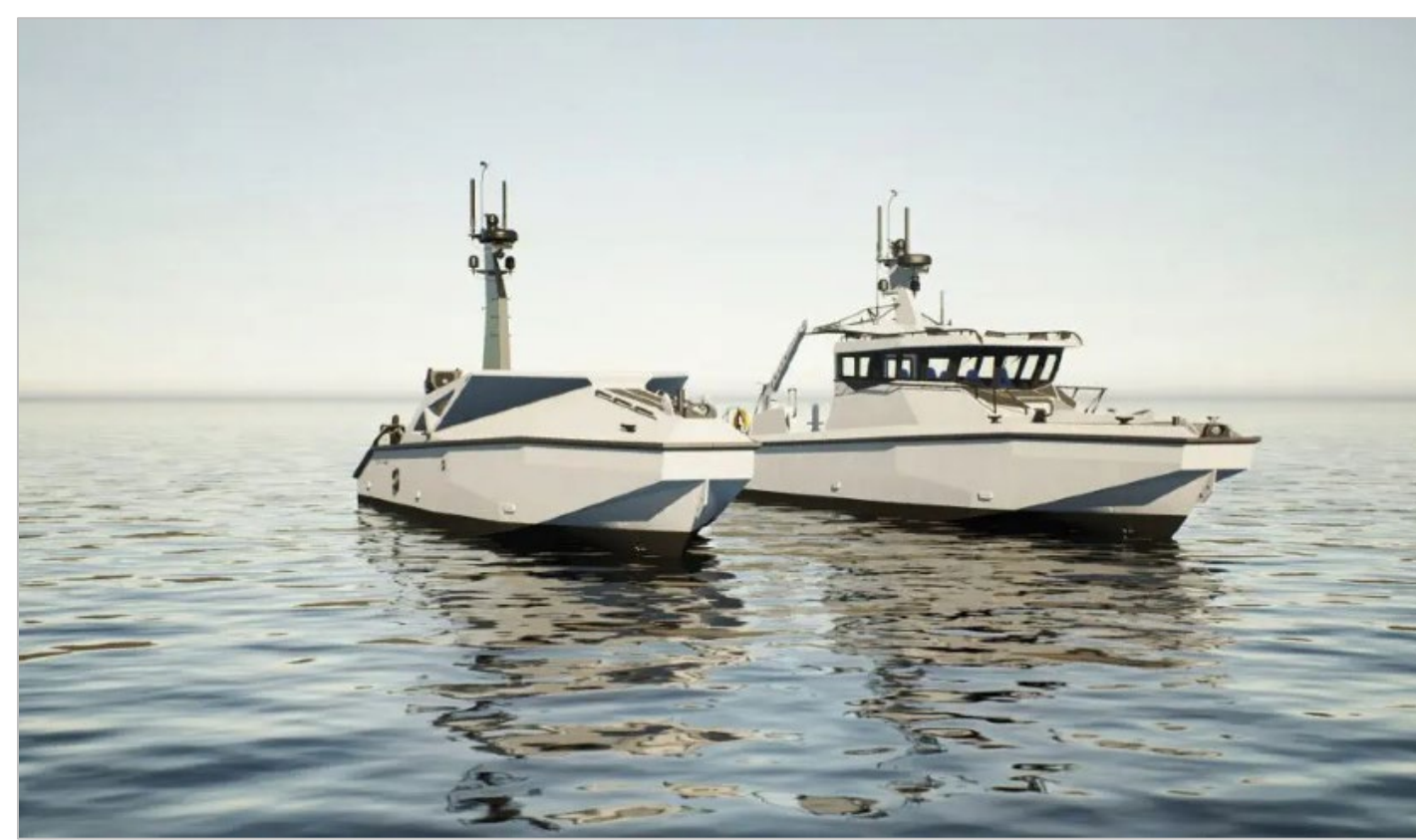
Metal Shark LRUSV and Command and Control Vessel