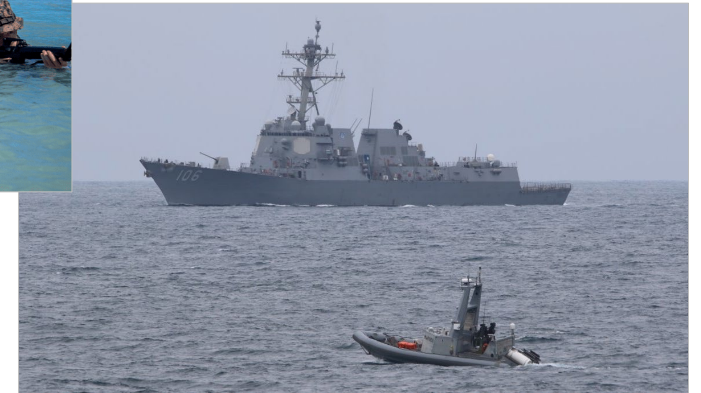
Unmanned LRUSV operating along with DDG-106 in a Hybrid Force concept demonstration in April 2021.