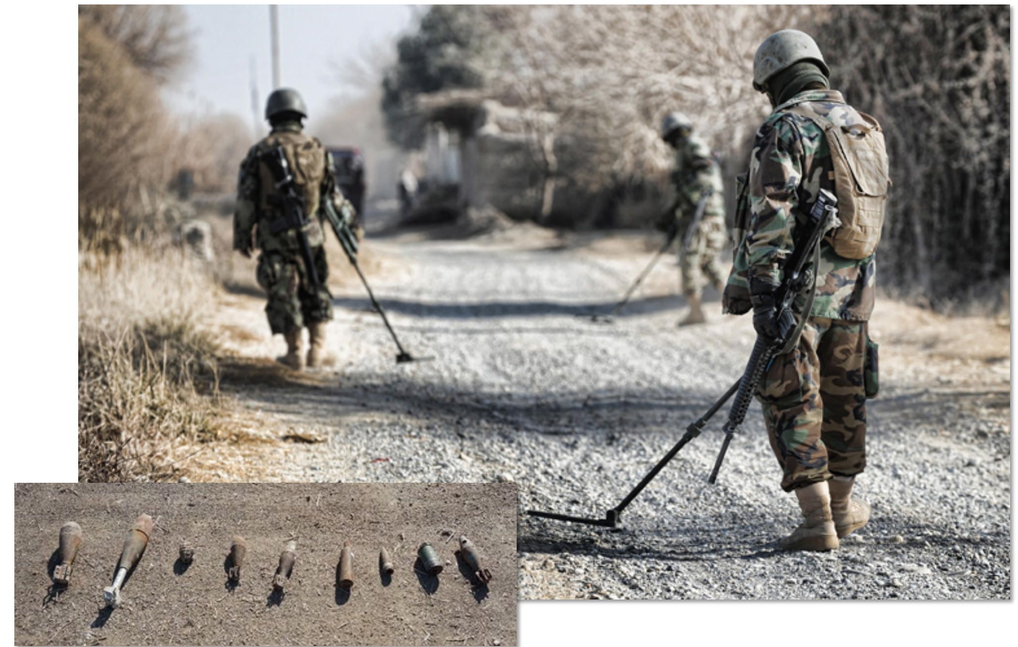
Unexploded ordnances (UXOs) / mines detection (DCT task)