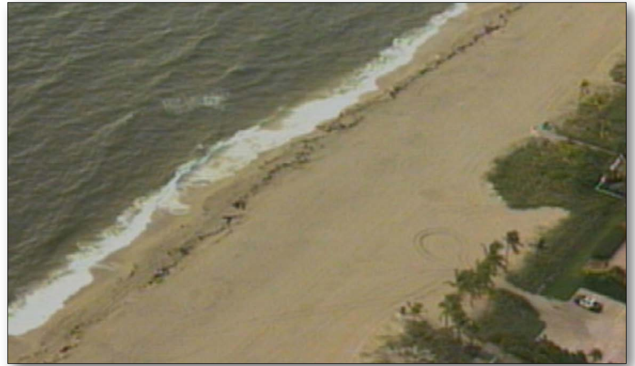
Marijuana bales washed up on a Florida Beach

Counter-drug agencies have encountered many illicit bales of drugs washed-up on shore of beaches around the Gulf of Mexico region, yet it is not clear where the packages originated or how long the packages had been drifting. This study uses ocean modeling to provide a physics-based solution that narrows the likely origins of the drifting drug bales and shed light on their “patterns of life.” Integration of intel collected by drug enforcement agencies to help guide and constrain the model to produce statistically significant, realistic output.