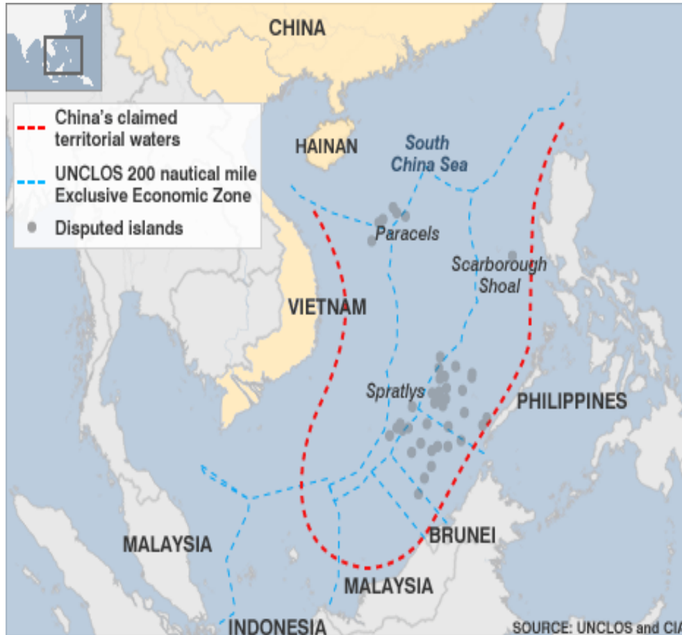
Figure 2. China's Claim to the South China Sea

the entire South China Sea as its territorial waters (Figure 2). 77 This claim by China puts it in direct conflict with other countries in the region, but most importantly with Vietnam, which also claims the Paracel Islands and most of the Spratly Islands.