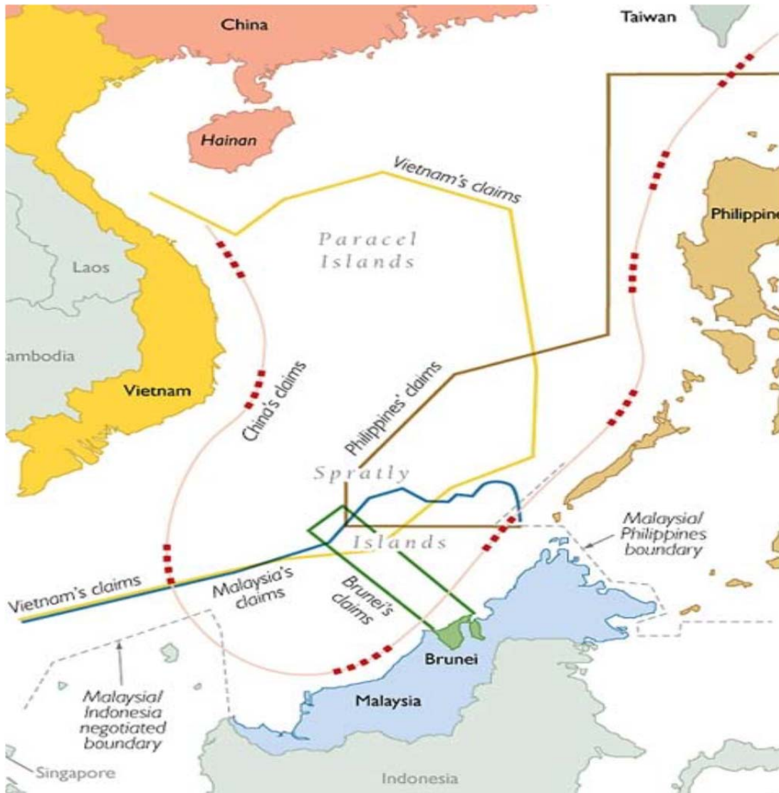
Figure 1. Conflicting Claims in the South China Sea (From: 74 )

Although China has conflicting claims over the sovereignty of the South China Sea with four other countries in the region, the focus of this chapter is the recent re-emergence of tensions between Vietnam and China. This recent rising of tensions