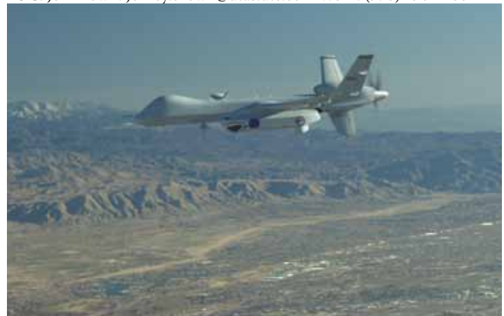
DB-110 on Predator B during Trial Falcon Prowl